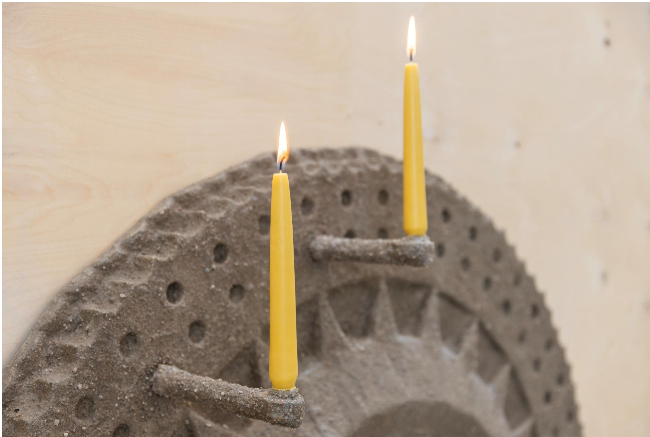
Routine, 2025 Printed ink and acrylic on canvas, pine wood, PLA, cement mix, copper bolts, PVA, water, filler, beeswax, candle wicks 105 x 105 x 10 cm