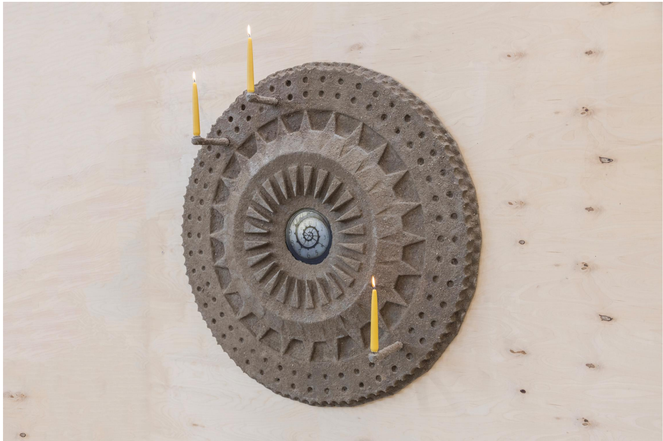
Routine, 2025 Printed ink and acrylic on canvas, pine wood, PLA, cement mix, copper bolts, PVA, water, filler, beeswax, candle wicks 105 x 105 x 10 cm

Accompanying the frozen clock are lit candles, transforming the works into working time pieces, being regularly replaced during a given exhibition period, effectively visualising the passing of time.