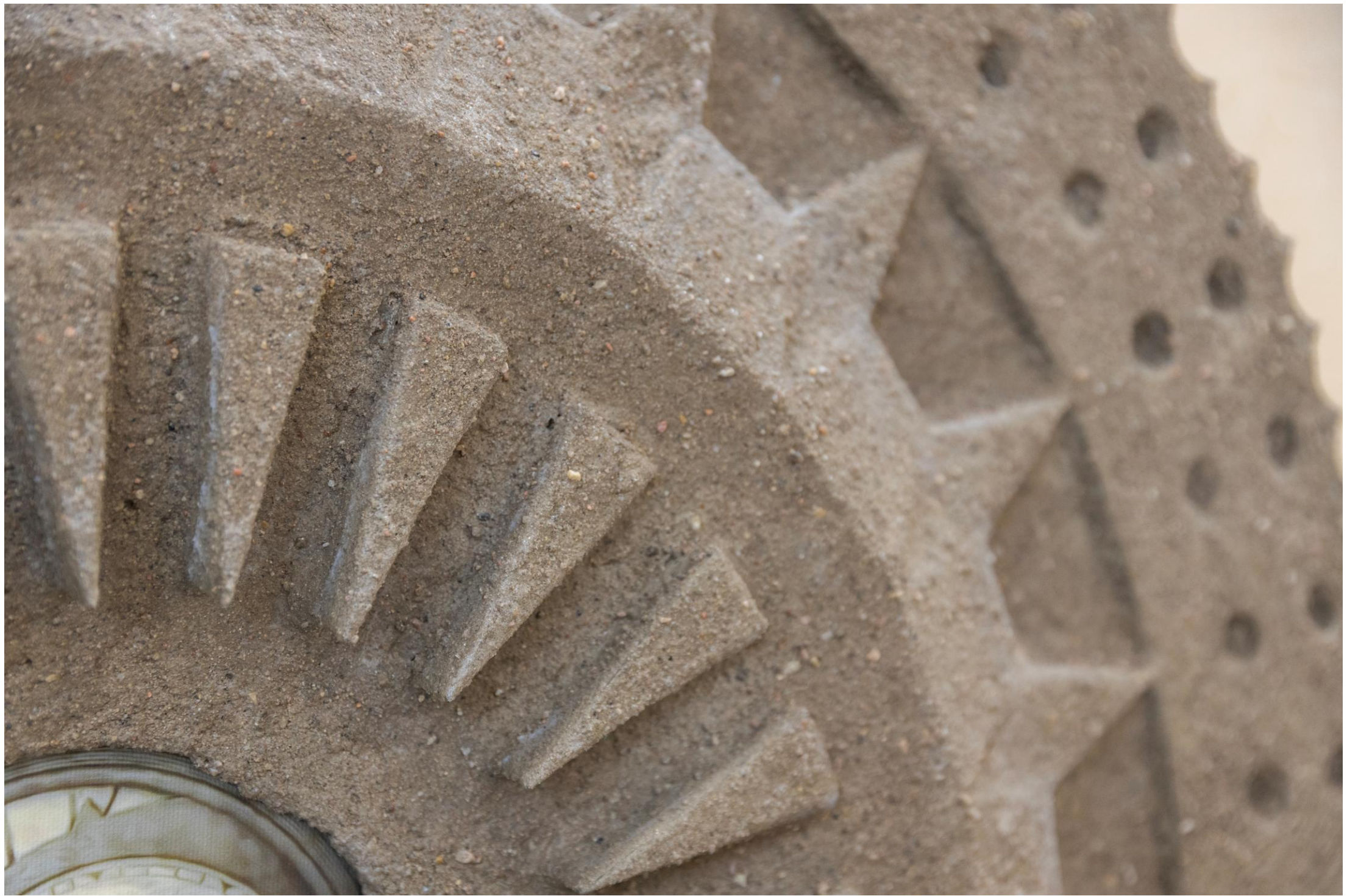
Routine, 2025 Printed ink and acrylic on canvas, pine wood, PLA, cement mix, copper bolts, PVA, water, filler, beeswax, candle wicks 105 x 105 x 10 cm