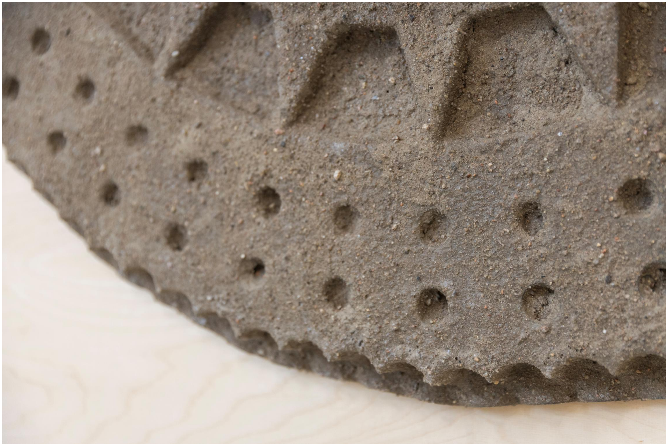
Routine, 2025 Printed ink and acrylic on canvas, pine wood, PLA, cement mix, copper bolts, PVA, water, filler, beeswax, candle wicks 105 x 105 x 10 cm