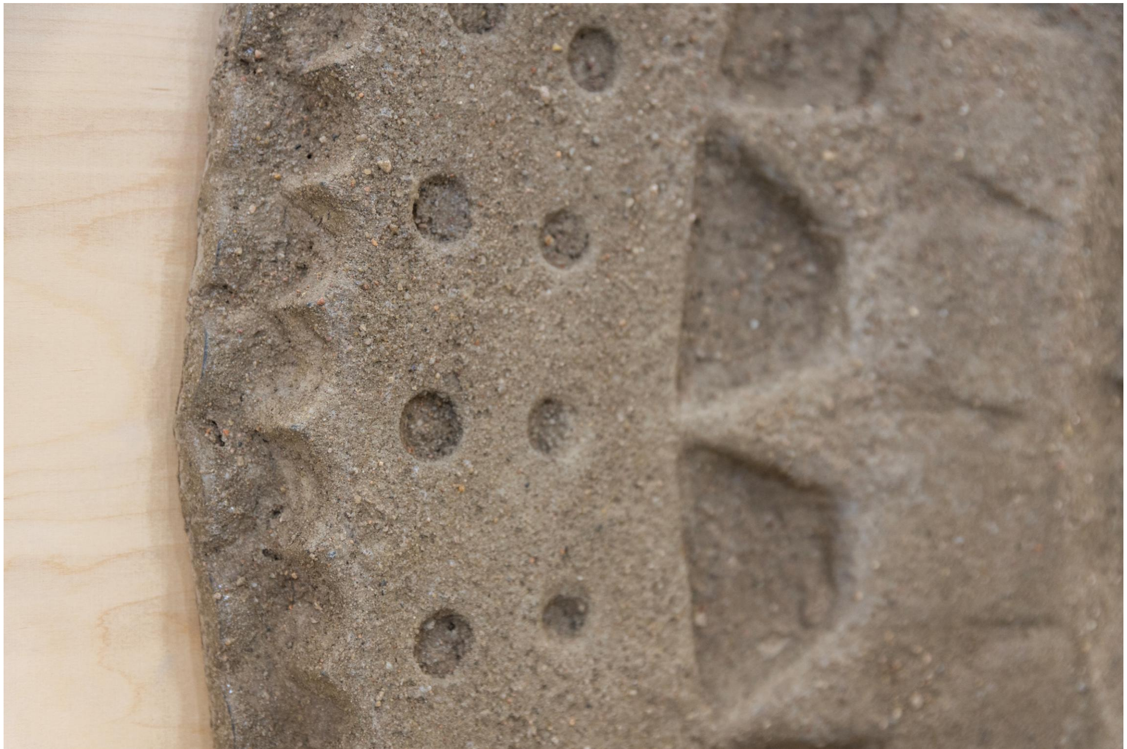
Routine, 2025 Printed ink and acrylic on canvas, pine wood, PLA, cement mix, copper bolts, PVA, water, filler, beeswax, candle wicks 105 x 105 x 10 cm