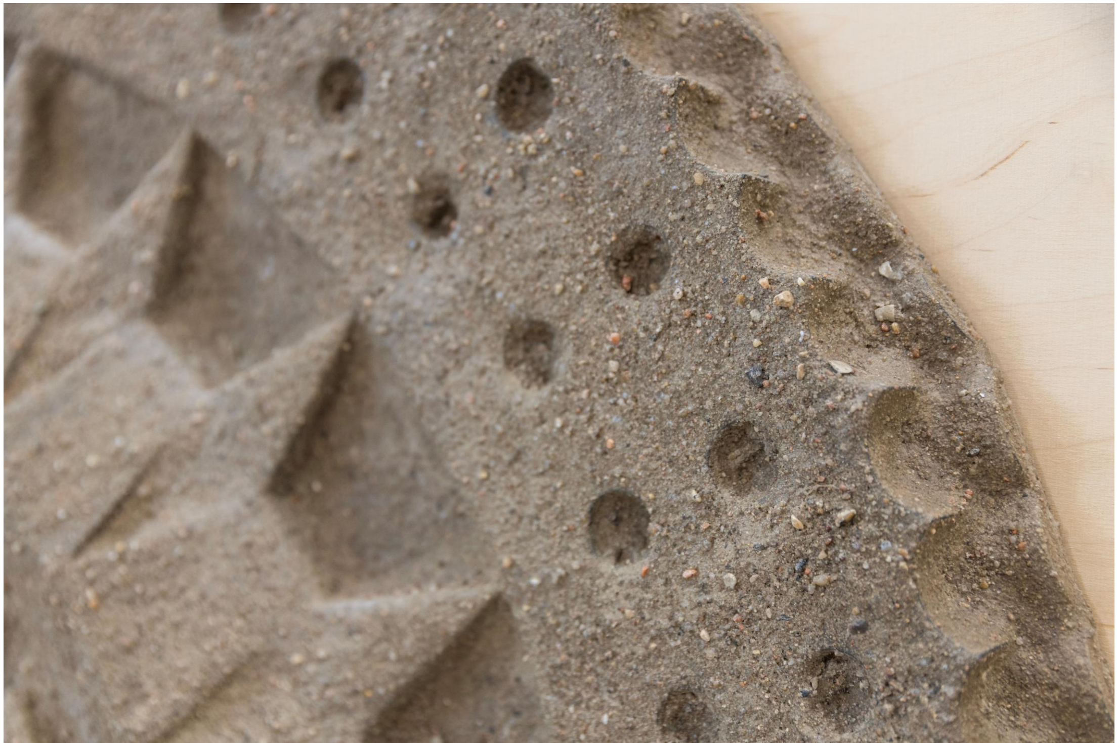
Routine, 2025 Printed ink and acrylic on canvas, pine wood, PLA, cement mix, copper bolts, PVA, water, filler, beeswax, candle wicks 105 x 105 x 10 cm