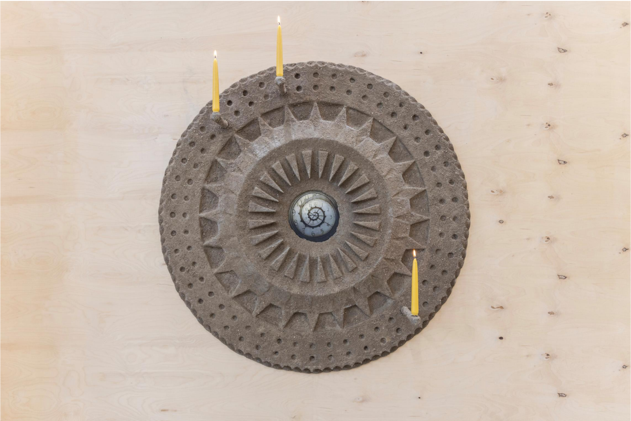
Routine, 2025 Printed ink and acrylic on canvas, pine wood, PLA, cement mix, copper bolts, PVA, water, filler, beeswax, candle wicks 105 x 105 x 10 cm

The inner hybrid painting is a clock documented from within a video game. The work is a hybrid painting, beginning as a digital image found within a game world. The image was then printed onto canvas, stretched and painted onto with acrylic paint, with the offline artist’s hand interacting with the original digital image.