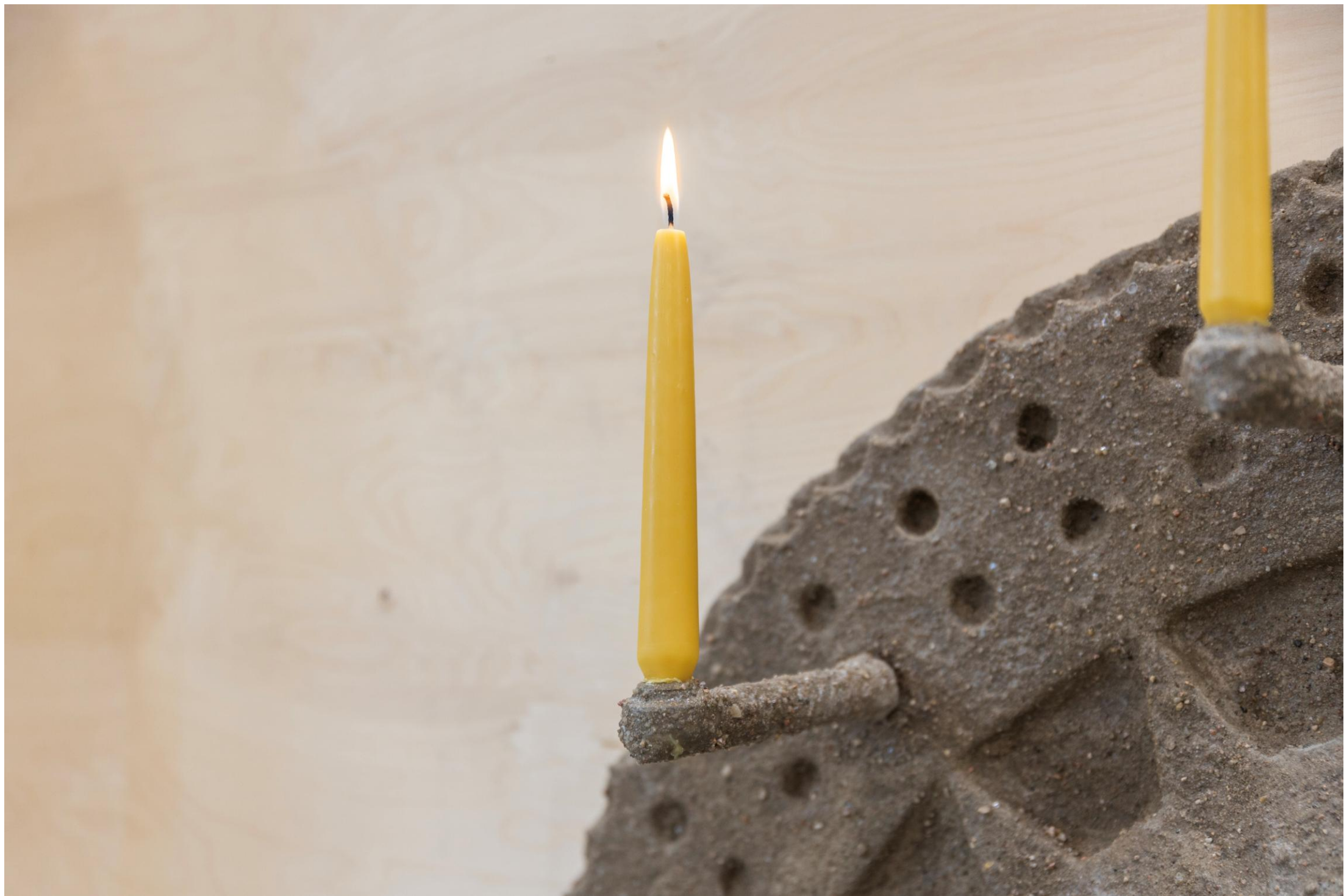
Routine, 2025 Printed ink and acrylic on canvas, pine wood, PLA, cement mix, copper bolts, PVA, water, filler, beeswax, candle wicks 105 x 105 x 10 cm