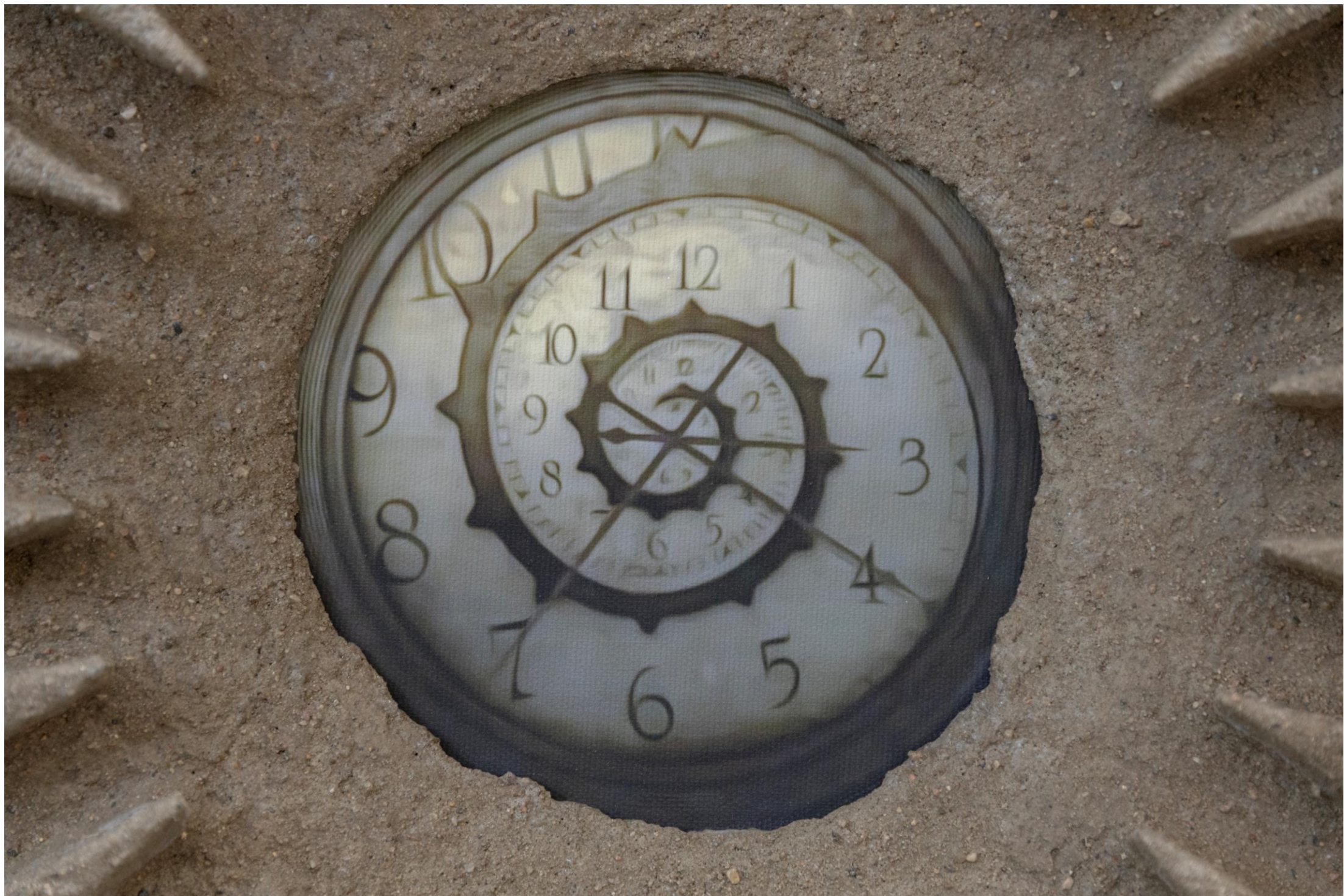
Routine, 2025 Printed ink and acrylic on canvas, pine wood, PLA, cement mix, copper bolts, PVA, water, filler, beeswax, candle wicks 105 x 105 x 10 cm