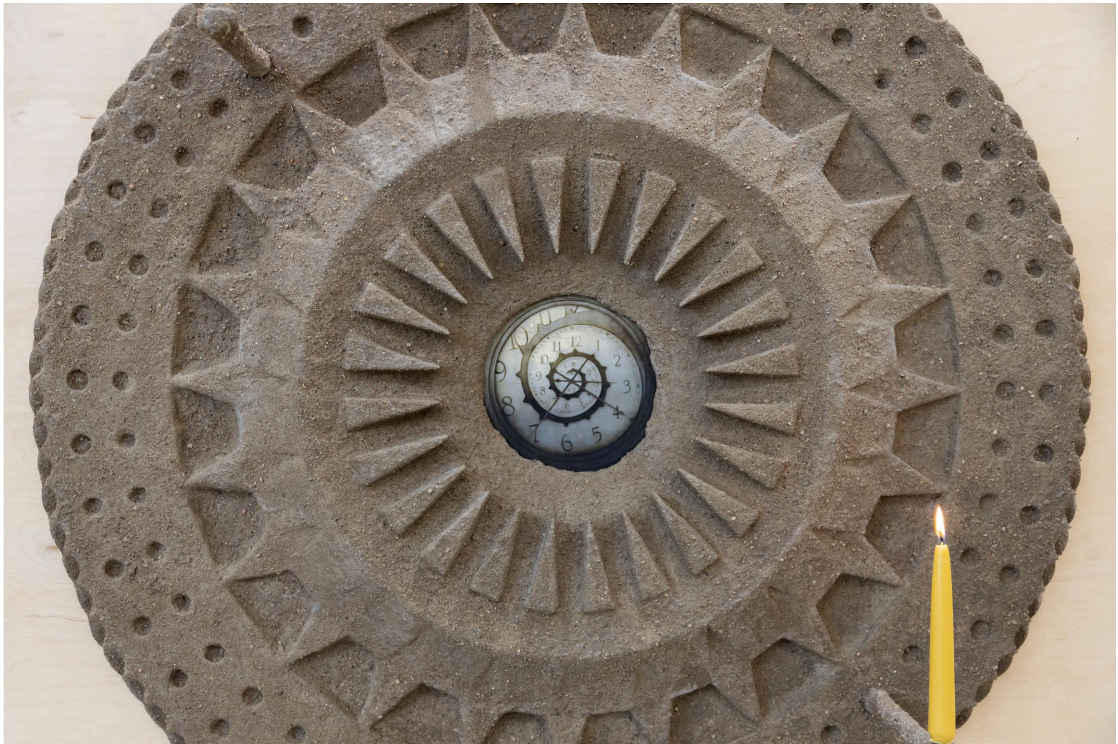
Routine, 2025 Printed ink and acrylic on canvas, pine wood, PLA, cement mix, copper bolts, PVA, water, filler, beeswax, candle wicks 105 x 105 x 10 cm