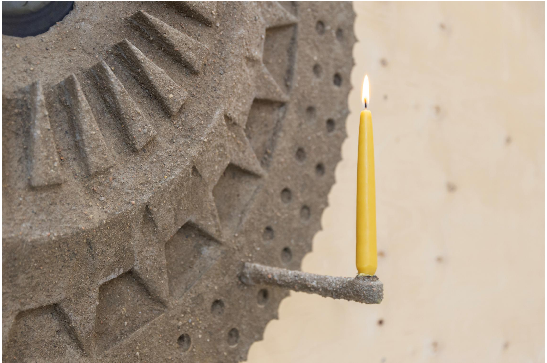
Routine, 2025 Printed ink and acrylic on canvas, pine wood, PLA, cement mix, copper bolts, PVA, water, filler, beeswax, candle wicks 105 x 105 x 10 cm