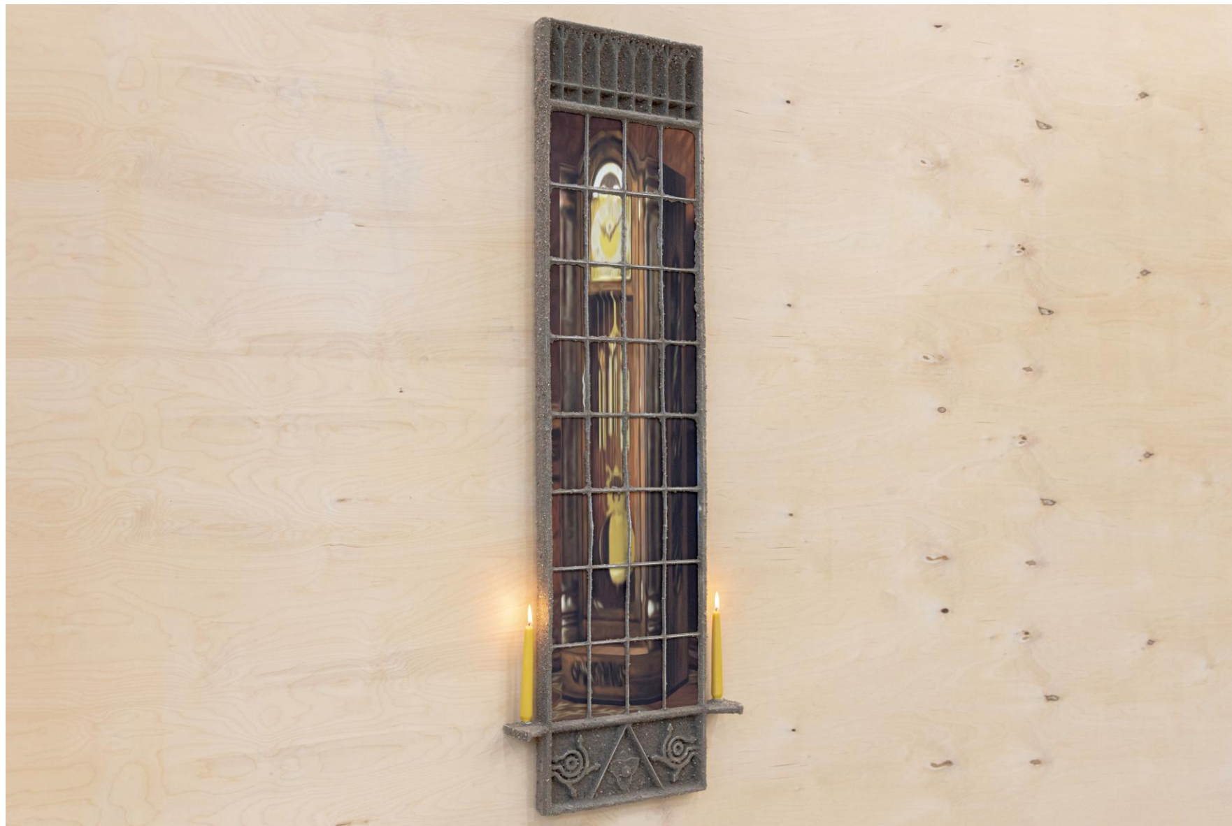
Threshold, 2025 Printed ink and acrylic on canvas, pine wood, PLA, cement mix, steel bolts, PVA, water, filler 130 x 45 x 8 cm