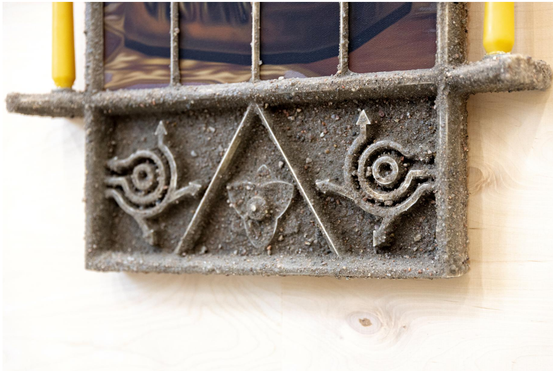
Threshold, 2025 Printed ink and acrylic on canvas, pine wood, PLA, cement mix, steel bolts, PVA, water, filler 130 x 45 x 8 cm