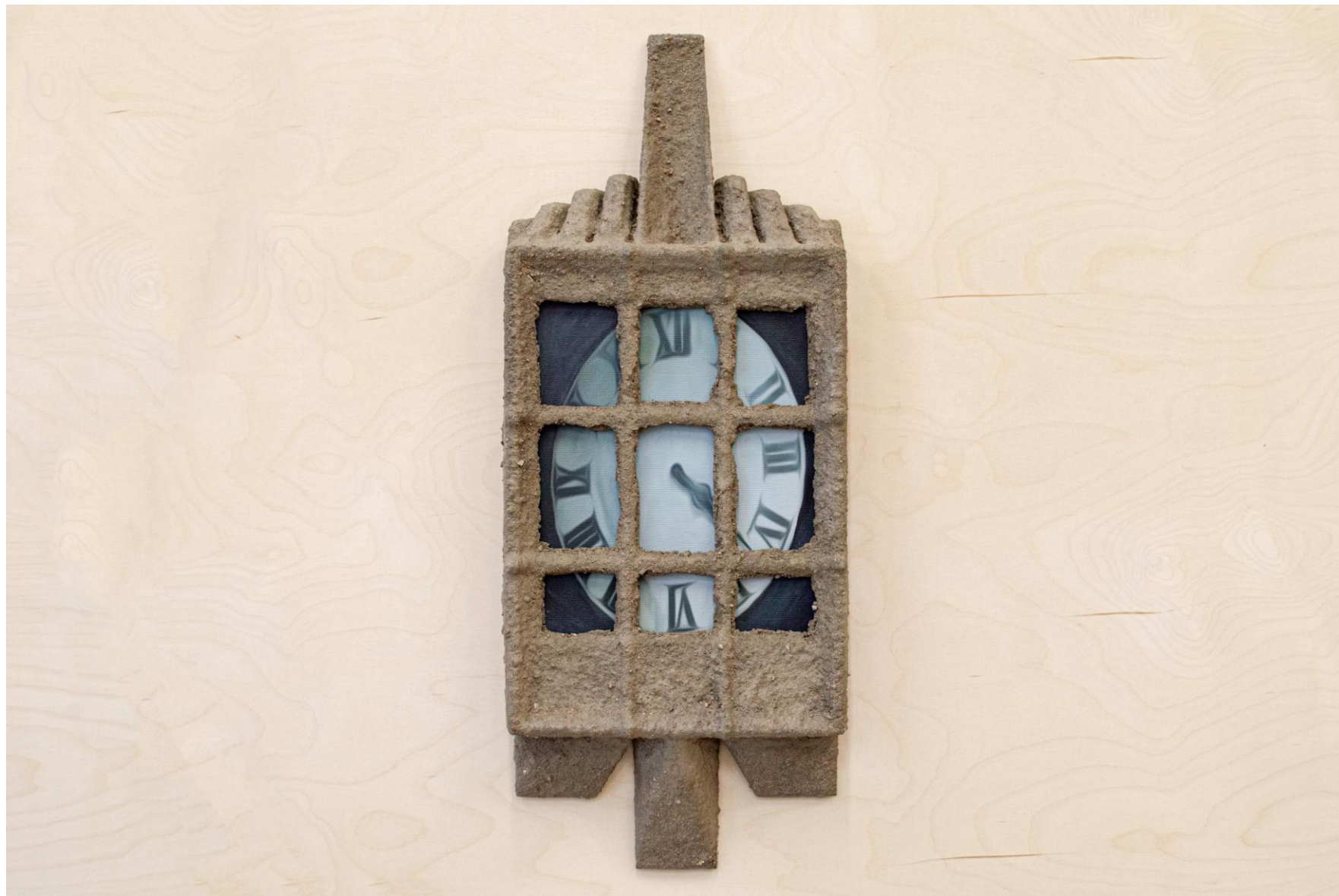
Module, 2025 Printed ink and acrylic on canvas, PLA, cement mix, PVA, water, steel bolt 57 x 22 x 4.4 cm