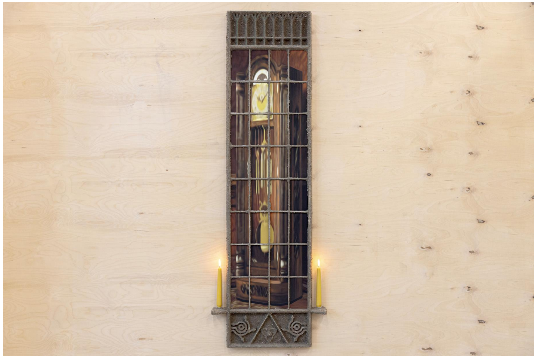
Threshold, 2025 Printed ink and acrylic on canvas, pine wood, PLA, cement mix, steel bolts, PVA, water, filler 130 x 45 x 8 cm

Accompanying the frozen clocks are lit candles, transforming the works into working time pieces.