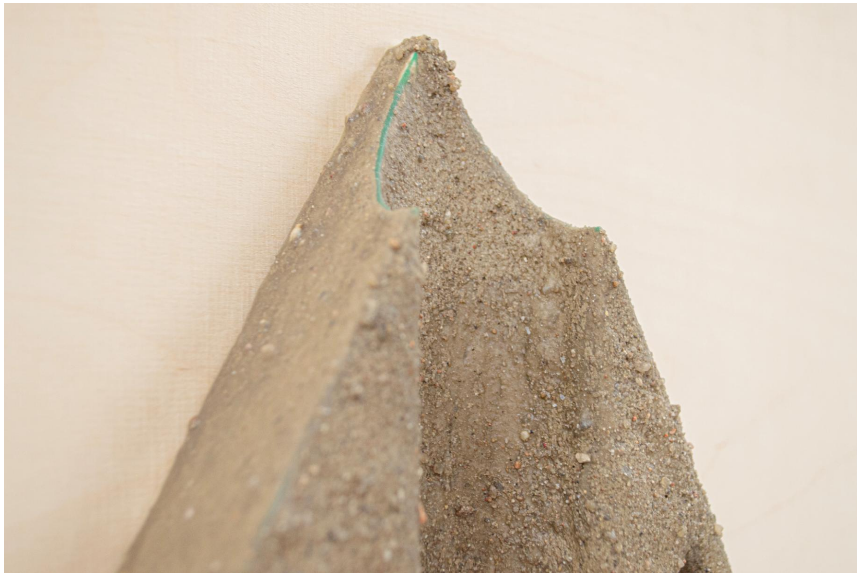
Passage, 2025 Printed ink and acrylic on canvas, pine wood, PLA, cement mix, PVA, water, filler 43 x 23 x 6 cm