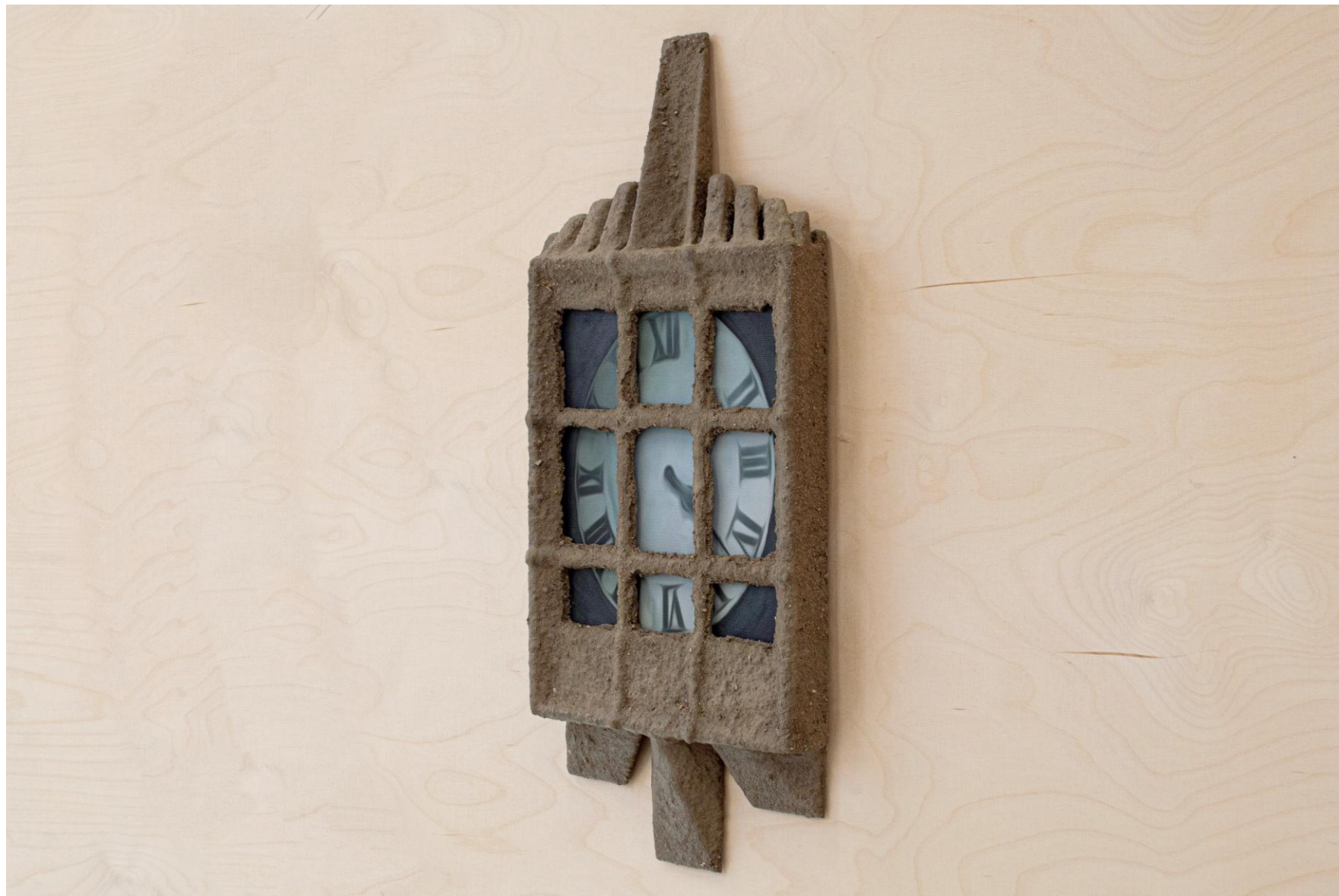
Module, 2025 Printed ink and acrylic on canvas, PLA, cement mix, PVA, water, steel bolt 57 x 22 x 4.4 cm