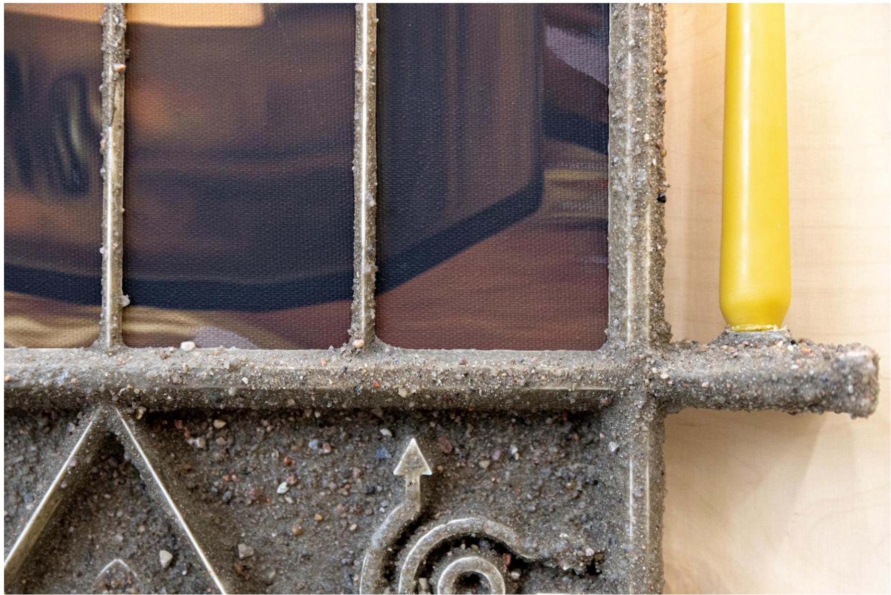
Threshold, 2025 Printed ink and acrylic on canvas, pine wood, PLA, cement mix, steel bolts, PVA, water, filler 130 x 45 x 8 cm