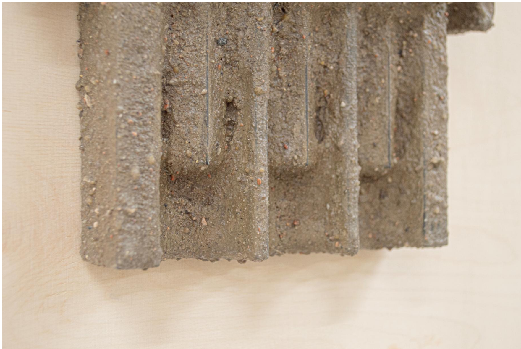
Passage, 2025 Printed ink and acrylic on canvas, pine wood, PLA, cement mix, PVA, water, filler 43 x 23 x 6 cm