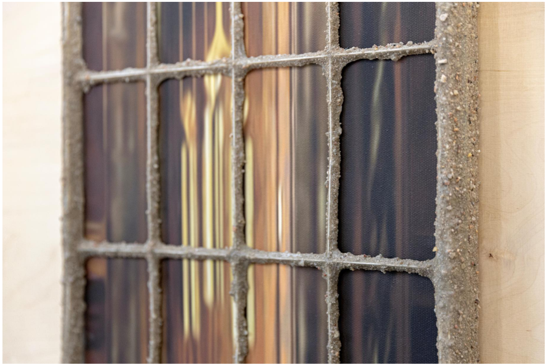
Threshold, 2025 Printed ink and acrylic on canvas, pine wood, PLA, cement mix, steel bolts, PVA, water, filler 130 x 45 x 8 cm