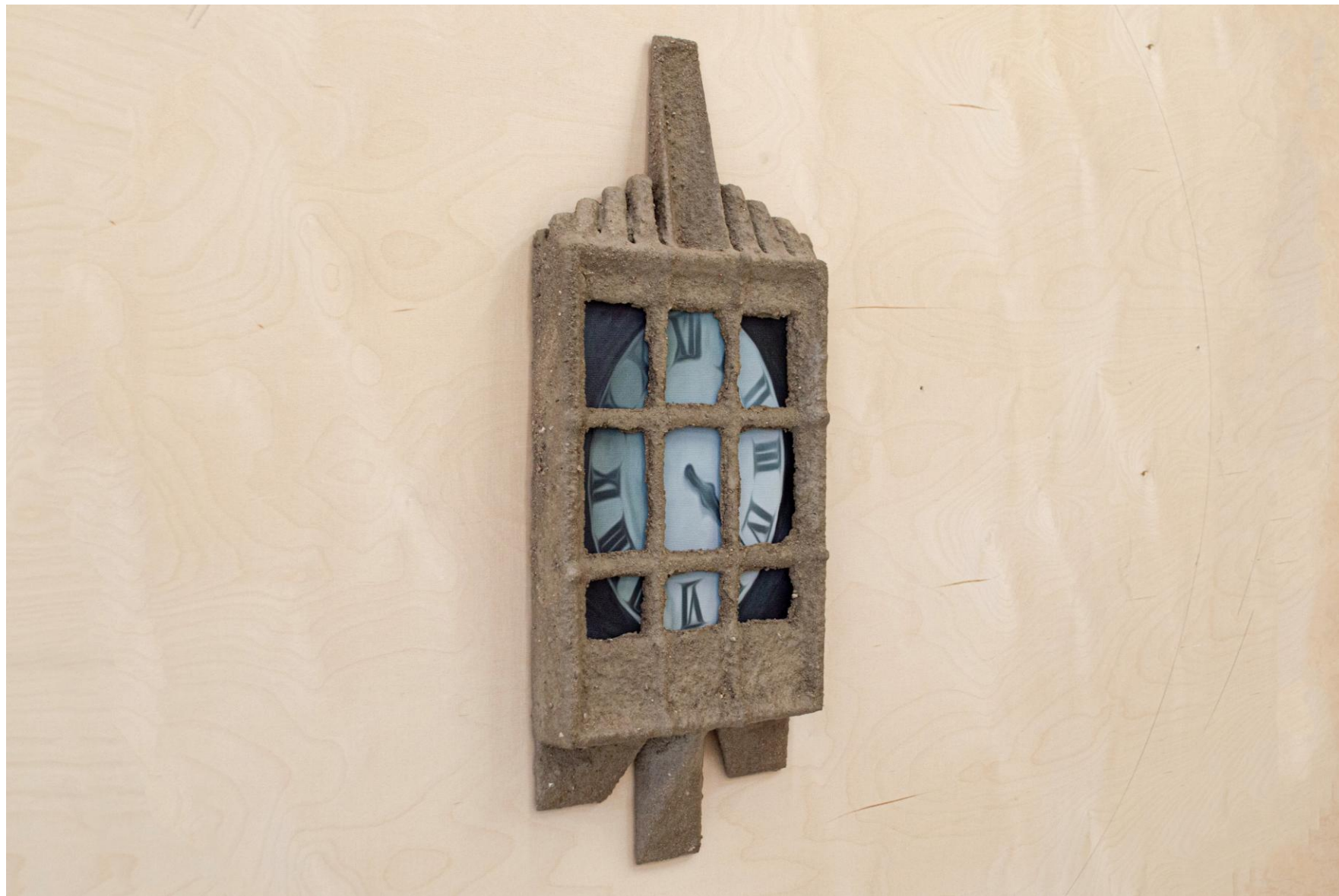
Module, 2025 Printed ink and acrylic on canvas, PLA, cement mix, PVA, water, steel bolt 57 x 22 x 4.4 cm