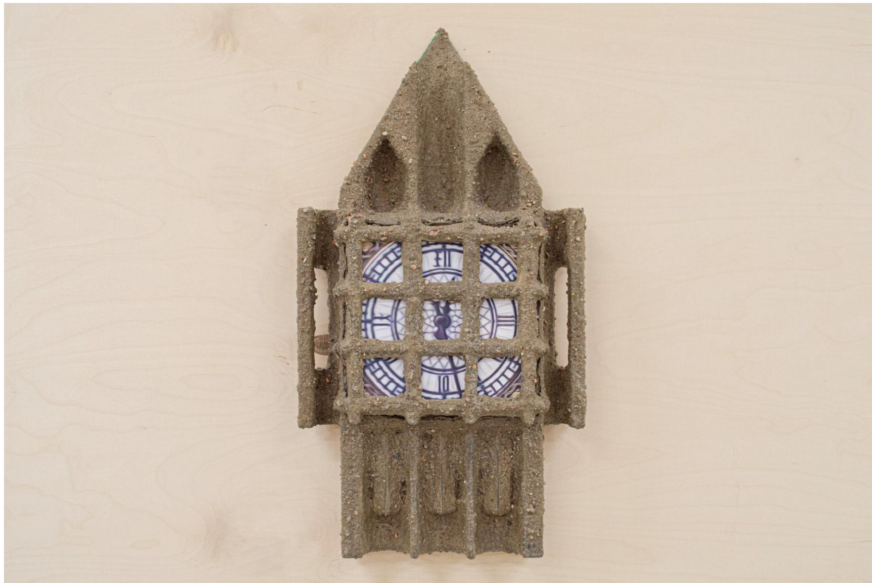
Passage, 2025 Printed ink and acrylic on canvas, pine wood, PLA, cement mix, PVA, water, filler 43 x 23 x 6 cm