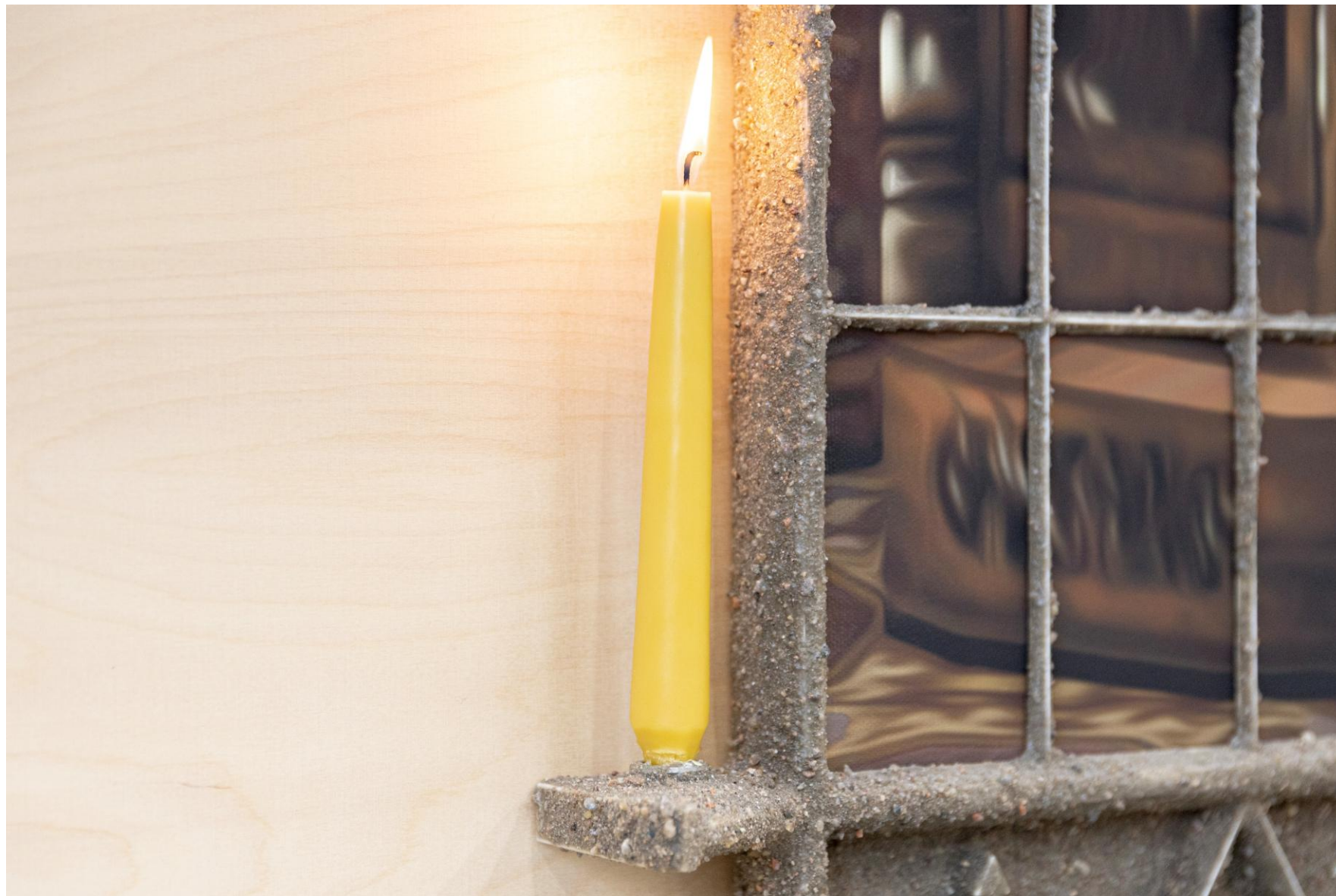
Threshold, 2025 Printed ink and acrylic on canvas, pine wood, PLA, cement mix, steel bolts, PVA, water, filler 130 x 45 x 8 cm