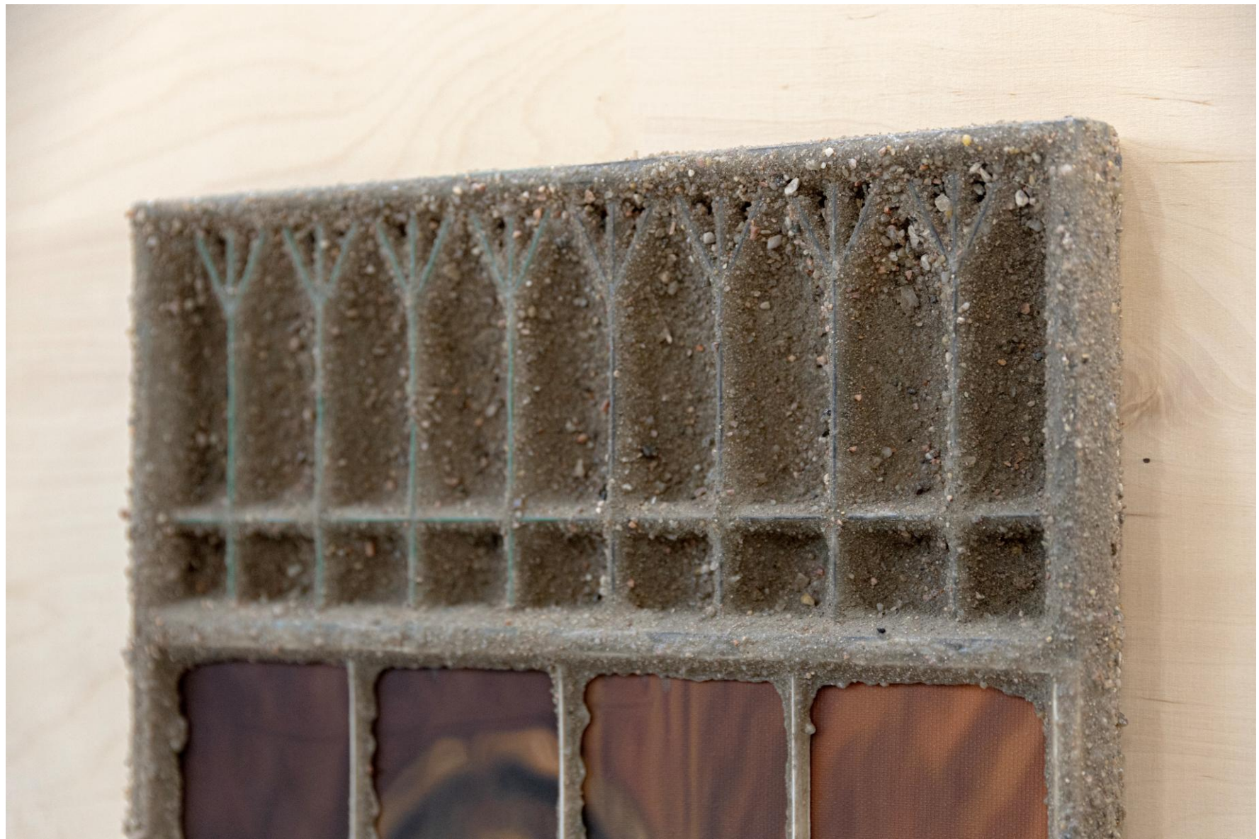
Threshold, 2025 Printed ink and acrylic on canvas, pine wood, PLA, cement mix, steel bolts, PVA, water, filler 130 x 45 x 8 cm