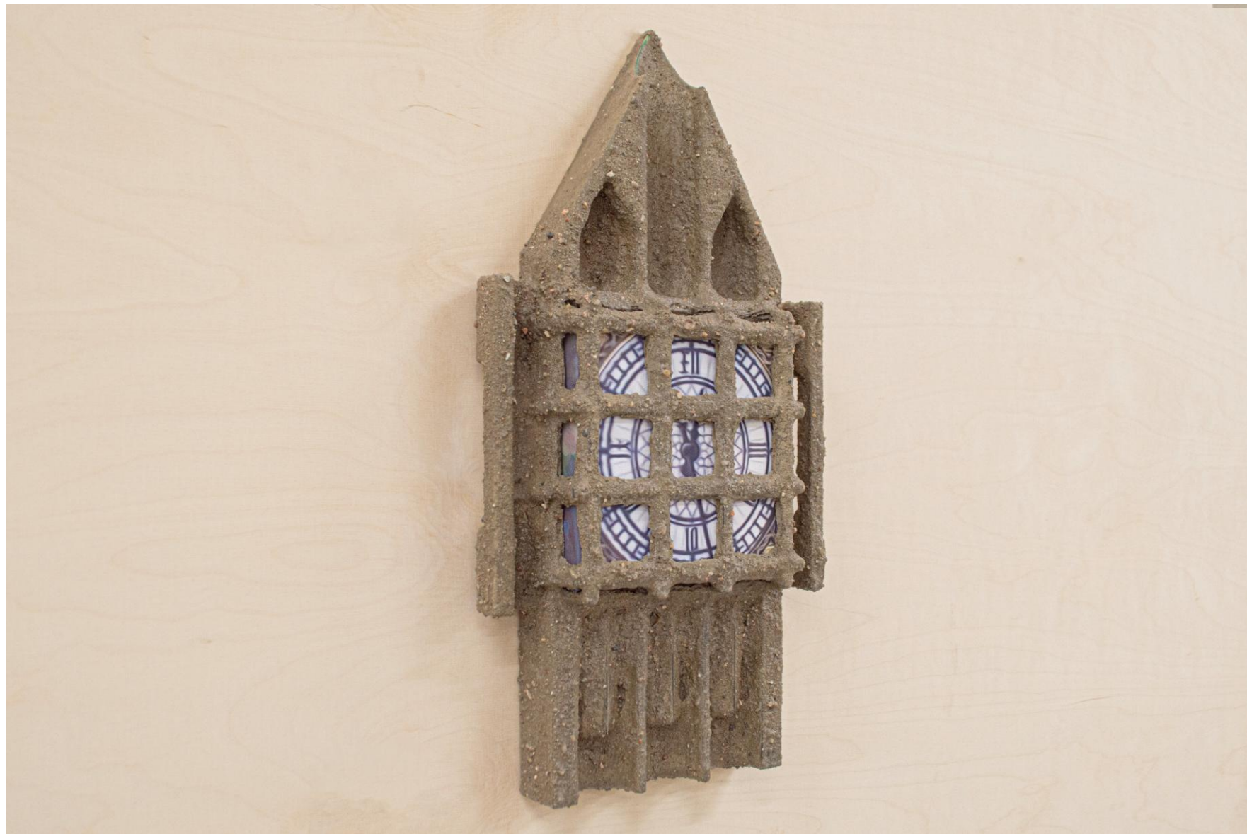
Passage, 2025 Printed ink and acrylic on canvas, pine wood, PLA, cement mix, PVA, water, filler 43 x 23 x 6 cm