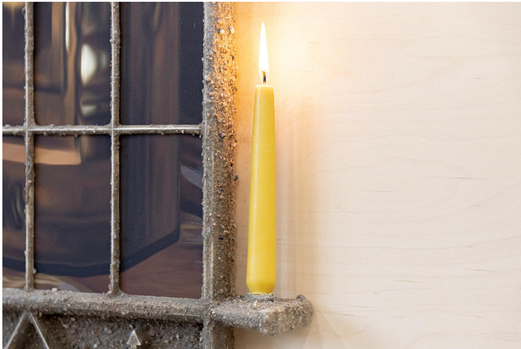
Threshold, 2025 Printed ink and acrylic on canvas, pine wood, PLA, cement mix, steel bolts, PVA, water, filler 130 x 45 x 8 cm