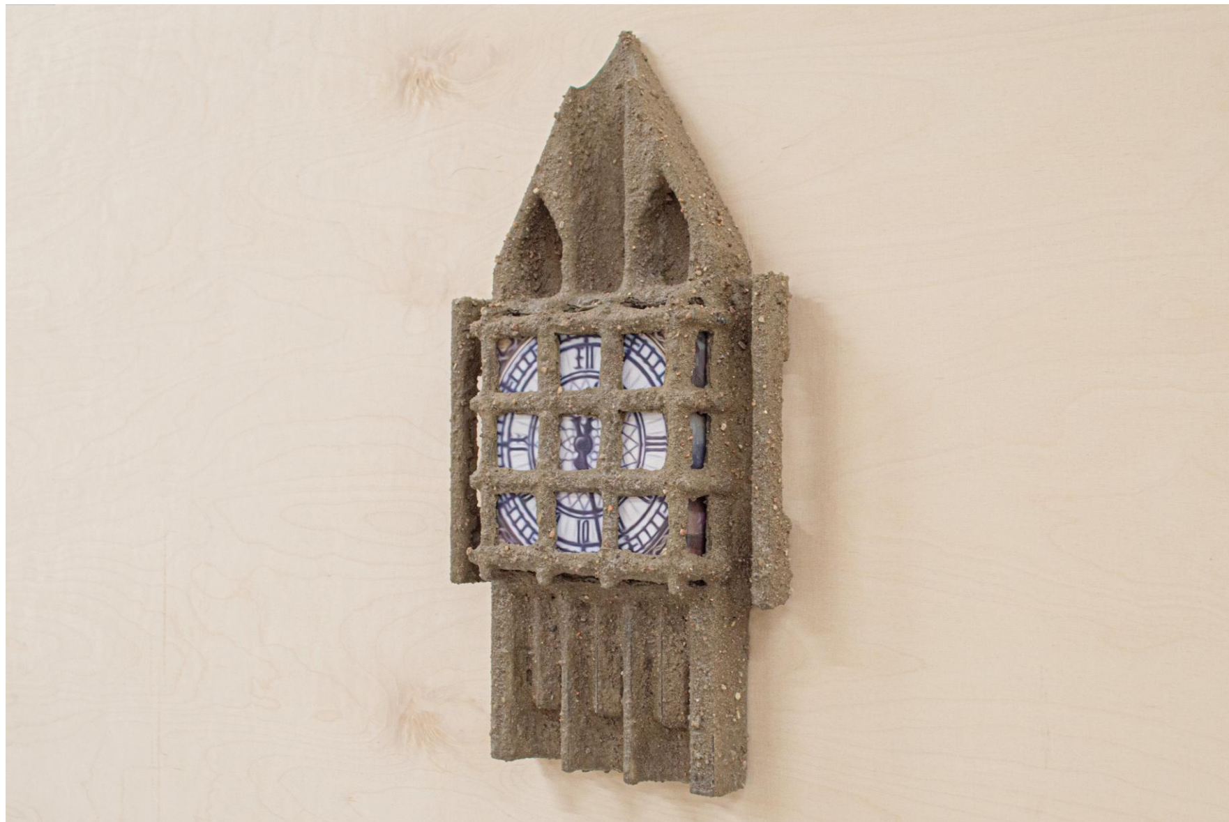
Passage, 2025 Printed ink and acrylic on canvas, pine wood, PLA, cement mix, PVA, water, filler 43 x 23 x 6 cm