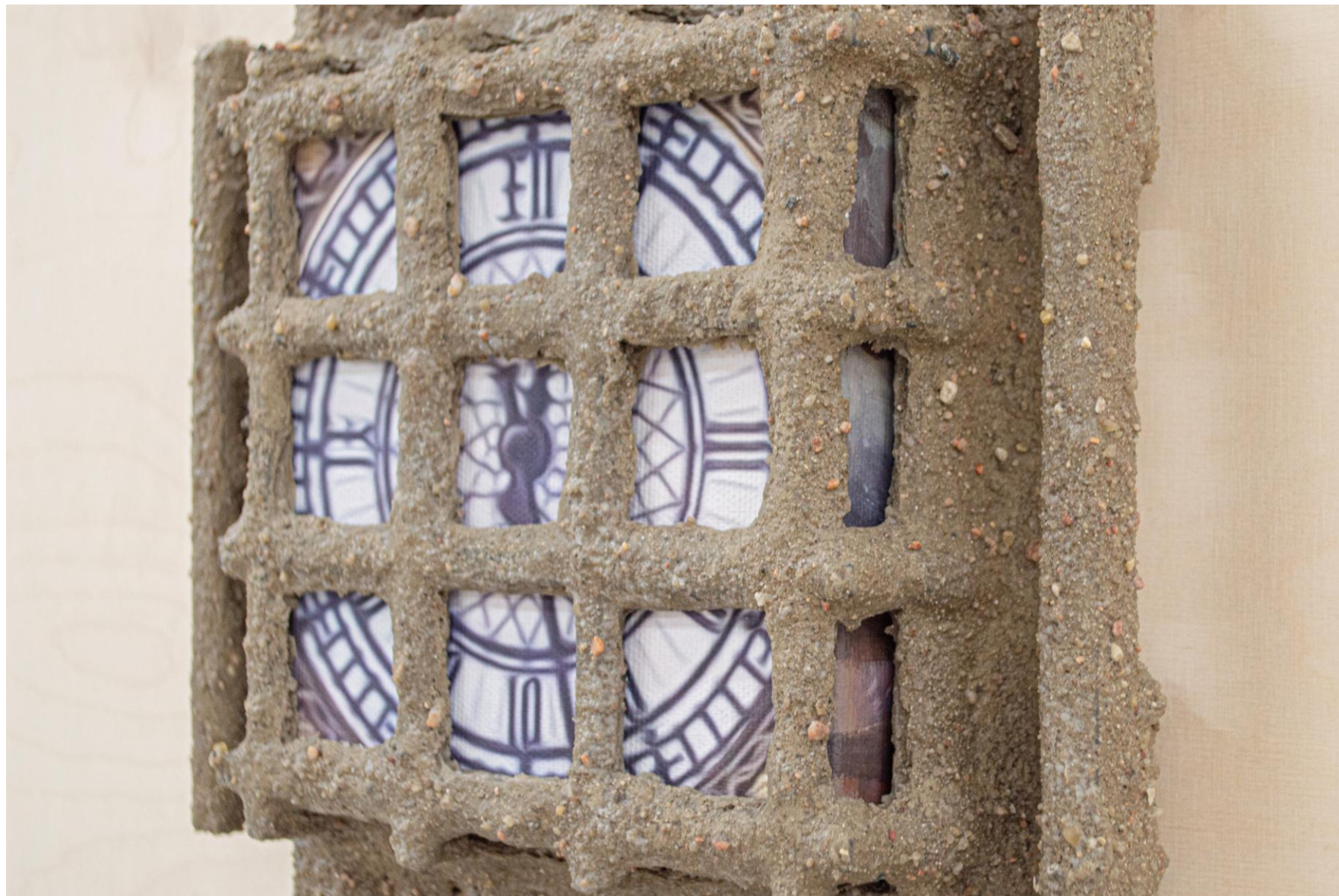
Passage, 2025 Printed ink and acrylic on canvas, pine wood, PLA, cement mix, PVA, water, filler 43 x 23 x 6 cm