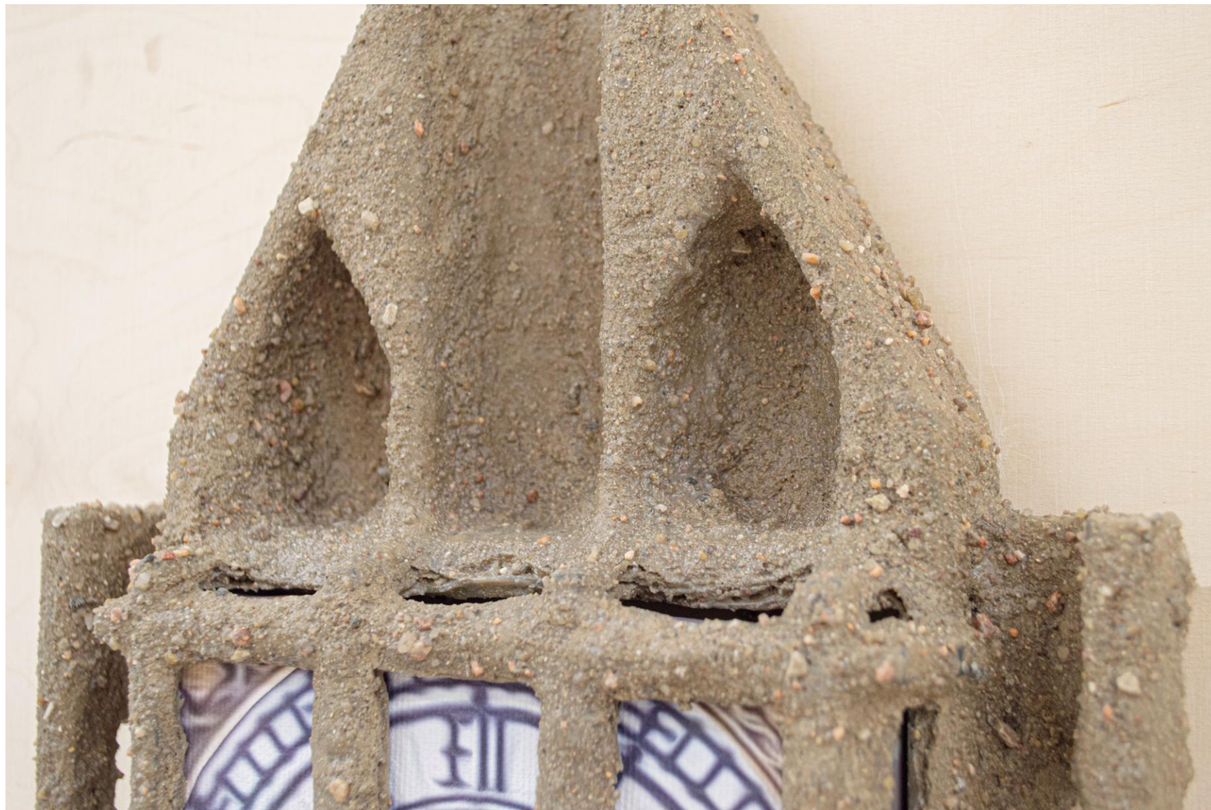
Passage, 2025 Printed ink and acrylic on canvas, pine wood, PLA, cement mix, PVA, water, filler 43 x 23 x 6 cm