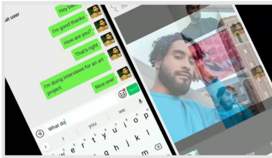
Will Fredo, Enclosures, 2019, video, 21:10 min.

Recently the exhibition "Come Closer!" the Gallery Office Impart its virtual gate, which deals with the topic of proximity. The physical closeness between people, the emotional and also the closeness to oneself can find different ways of expression and feel different for everyone. Technology has a not inconsiderable effect on this - nowadays, despite great distances, it is always possible to communicate and be reachable at any time. In the first part of the exhibition, the artists present their negotiations with "proximity". Those who want to learn more about Office Impart can here read an interview by editor Teresa with the founders.