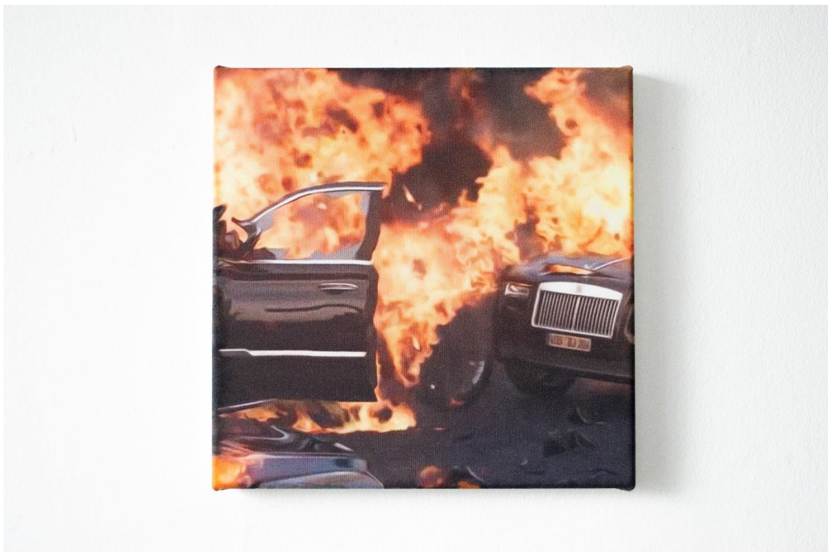
Ambush II, 2020 Ink and acrylic on canvas 30 x 30 cm Unique