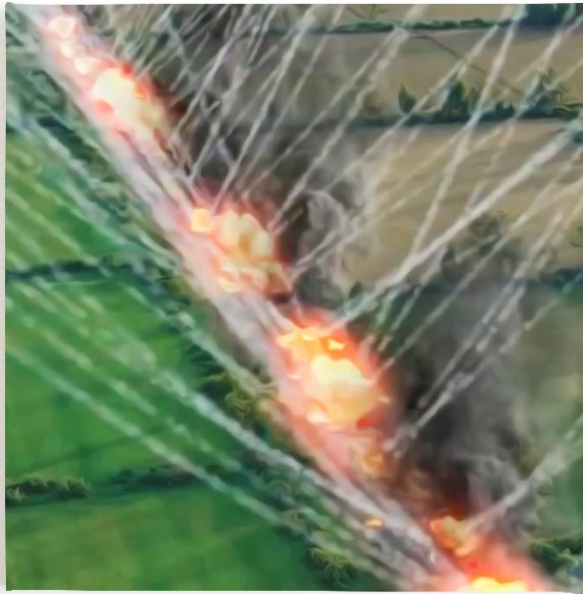
Hellfire, 2020 Ink and acrylic on canvas 30 x 30 cm Unique