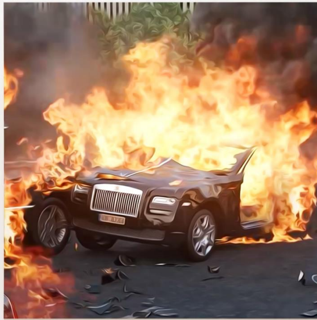
Ambush I, 2020 Ink and acrylic on canvas 140 x 140 cm Unique