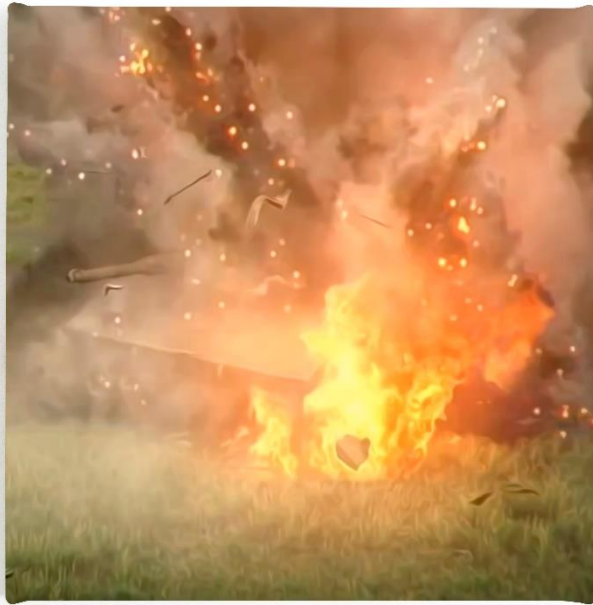
Jack In The Box, 2020 Ink and acrylic on canvas 30 x 30 cm Unique