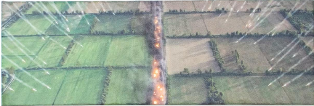
Strike, 2021 Ink and acrylic on canvas 30 x 30 cm Unique