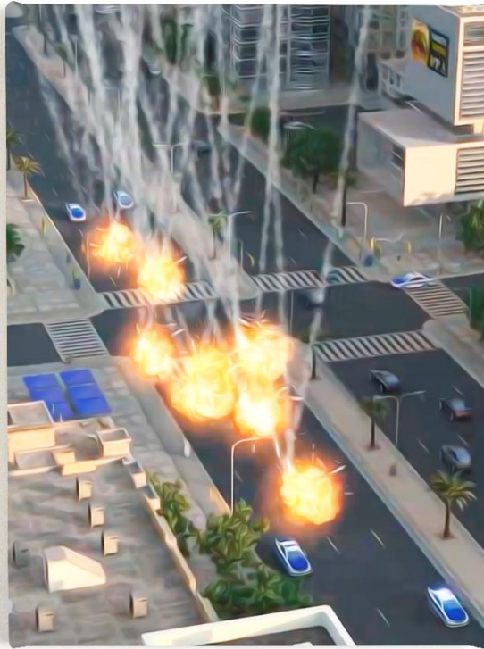
Hellfire III, 2020 Ink and acrylic on canvas 40 x 30 cm Unique