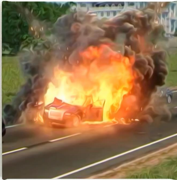
Ambush III, 2020 Ink and acrylic on canvas 30 x 30 cm Unique