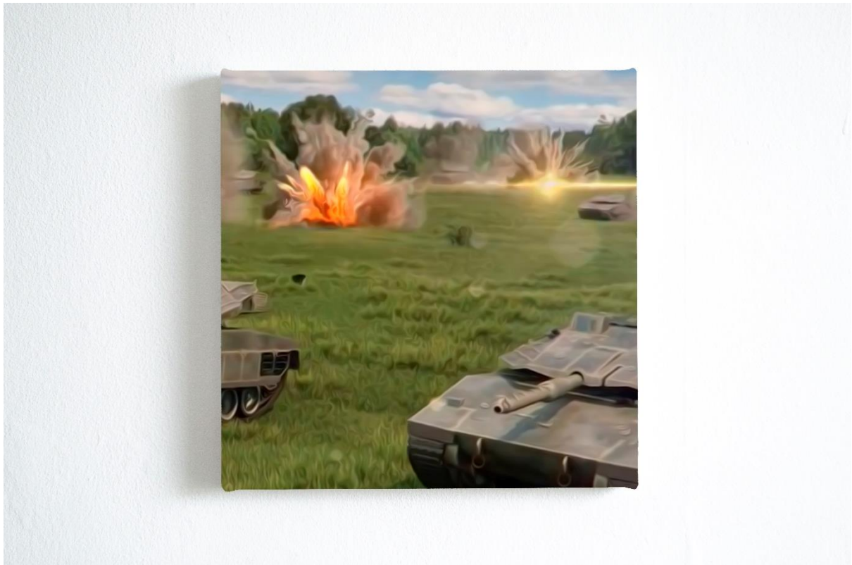
Exclusion Zone, 2020 Ink and acrylic on canvas 30 x 30 cm Unique