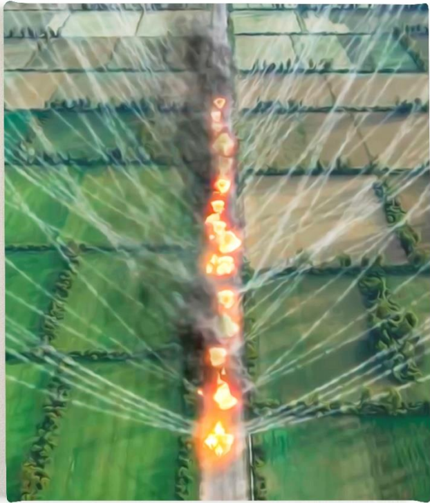
Hellfire II, 2020 Ink and acrylic on canvas 70 x 60 cm Unique