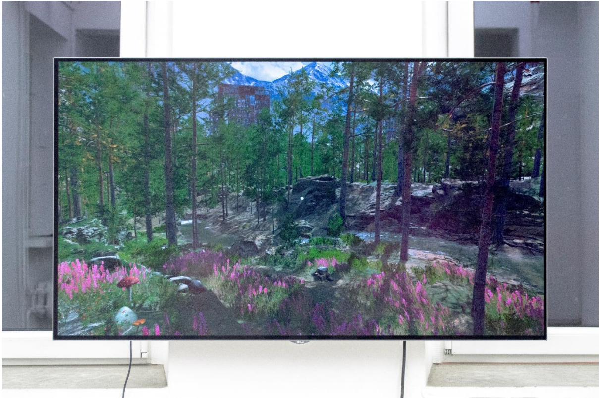
The Forest, 2022 Video game, Microsoft controller, Razer gaming laptop, 60 inch TV, tree stumps Dimensions variable