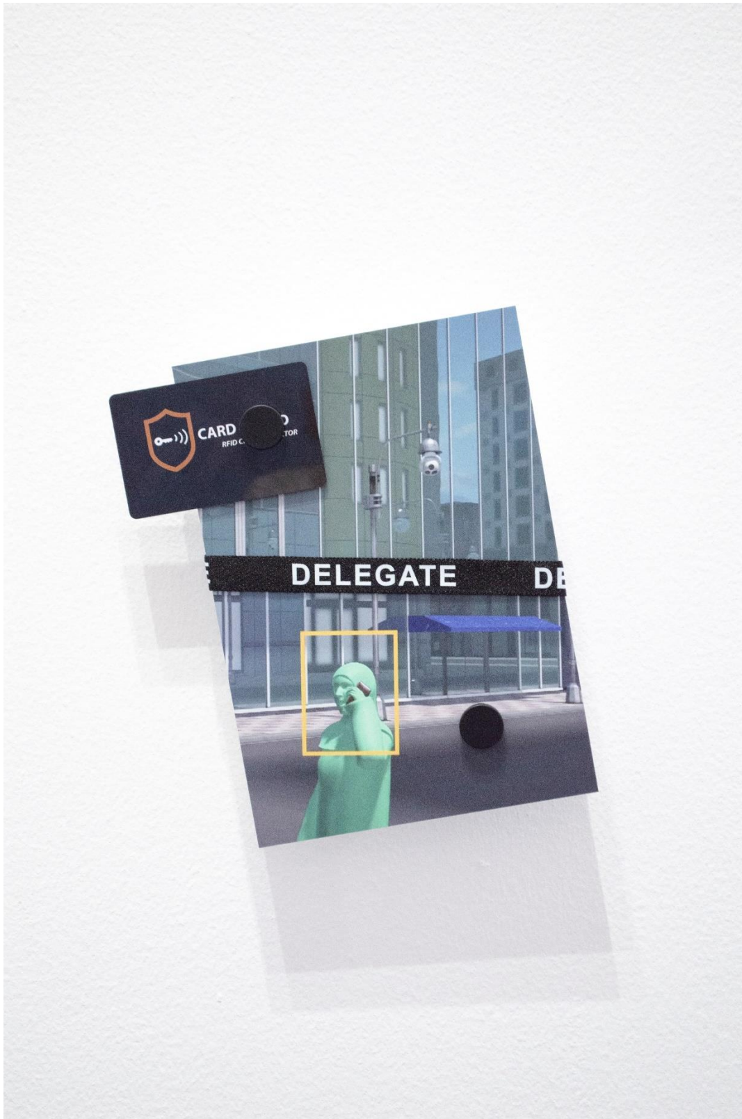
State of Affairs (Supplementary Material II), 2018 C-type print on aluminium dibond, RFID credit card protector, security lanyard, matt black standoff advertising screw nails 23 x 21 x 3 cm Unique