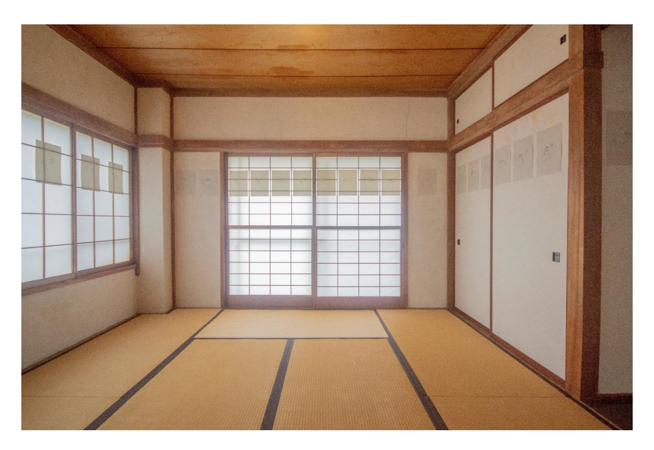
Towards A Consensual Hallucination, 2023 Installation view