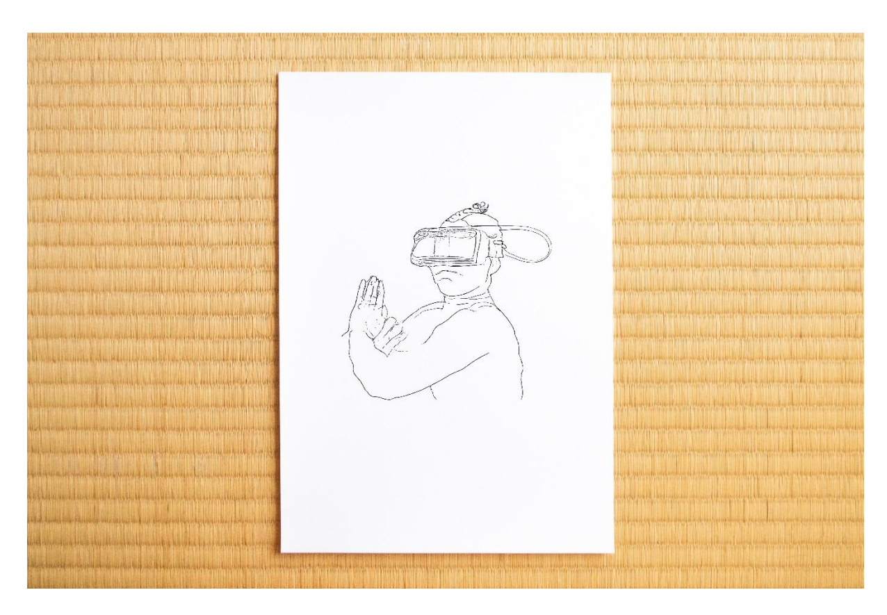
Towards A Consensual Hallucination II, 2023 Black gel ink on 380gsm Hahnemuhle photo rag 29.7 x 21 cm