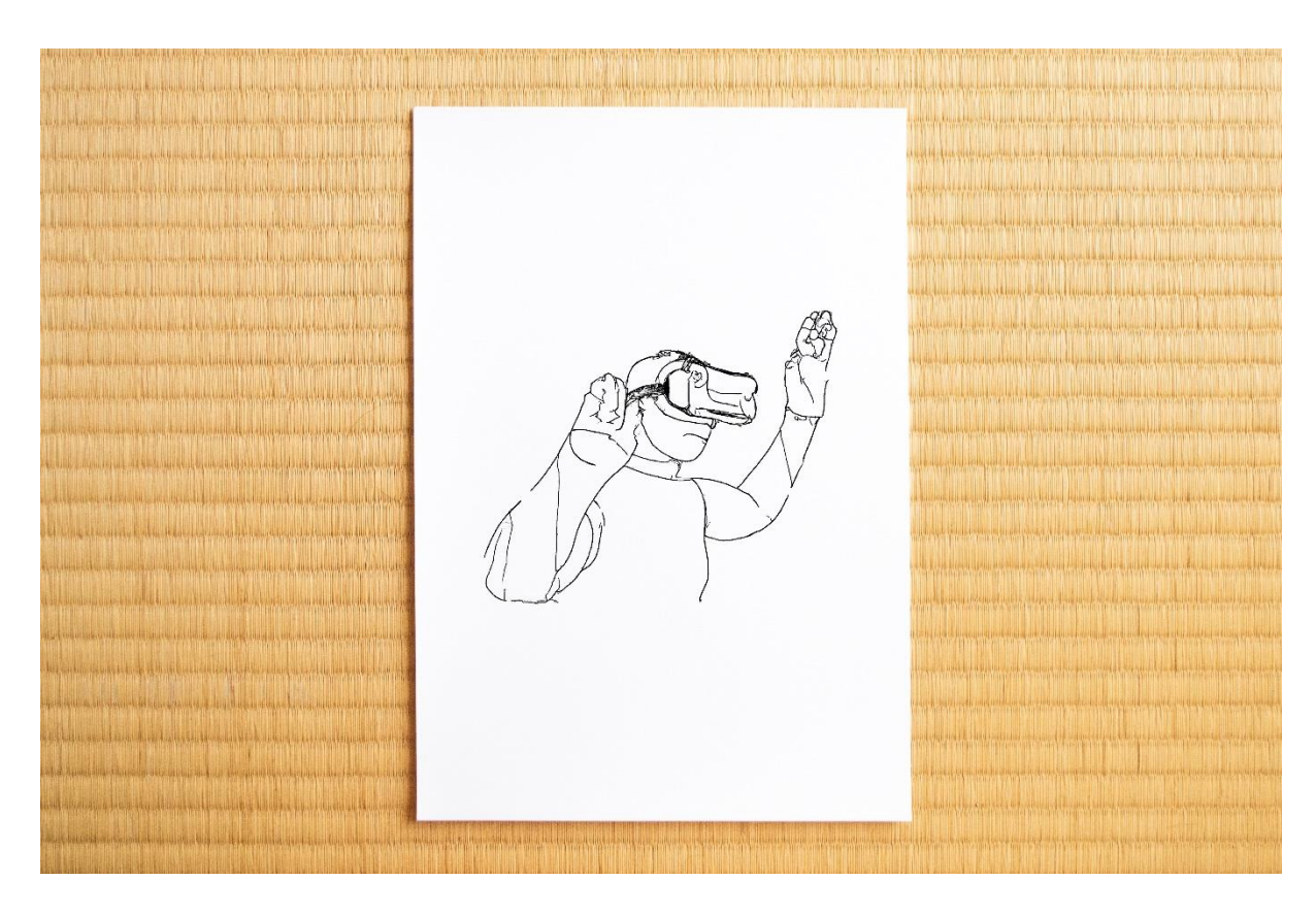
Towards A Consensual Hallucination VII, 2023 Black gel ink on 380gsm Hahnemuhle photo rag 29.7 x 21 cm