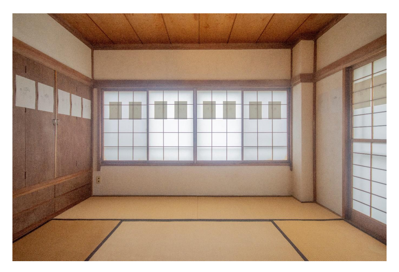
Towards A Consensual Hallucination, 2023 Installation view