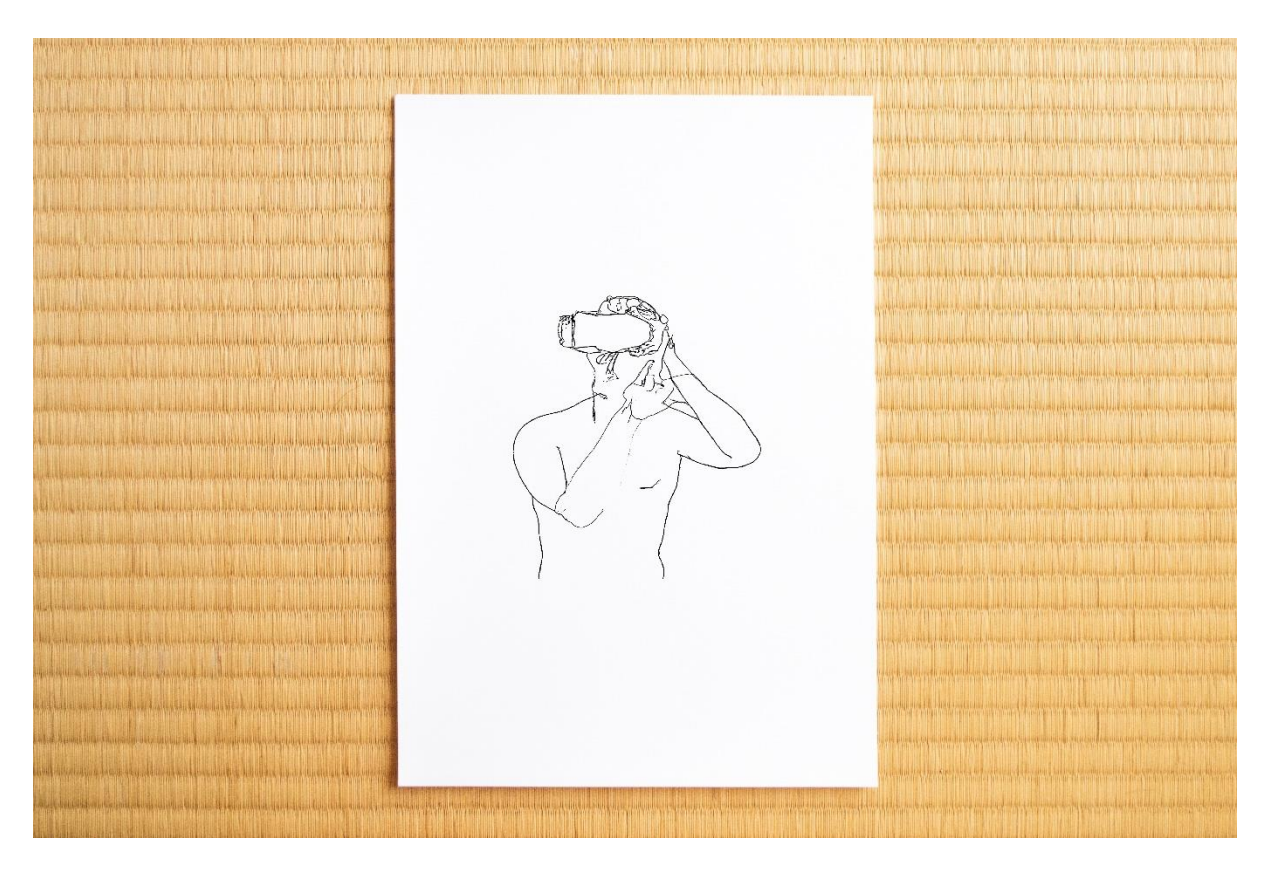
Towards A Consensual Hallucination VI, 2023 Black gel ink on 380gsm Hahnemuhle photo rag 29.7 x 21 cm