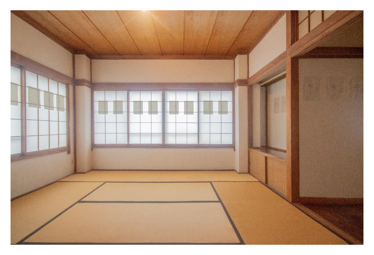
Towards A Consensual Hallucination, 2023 Installation view