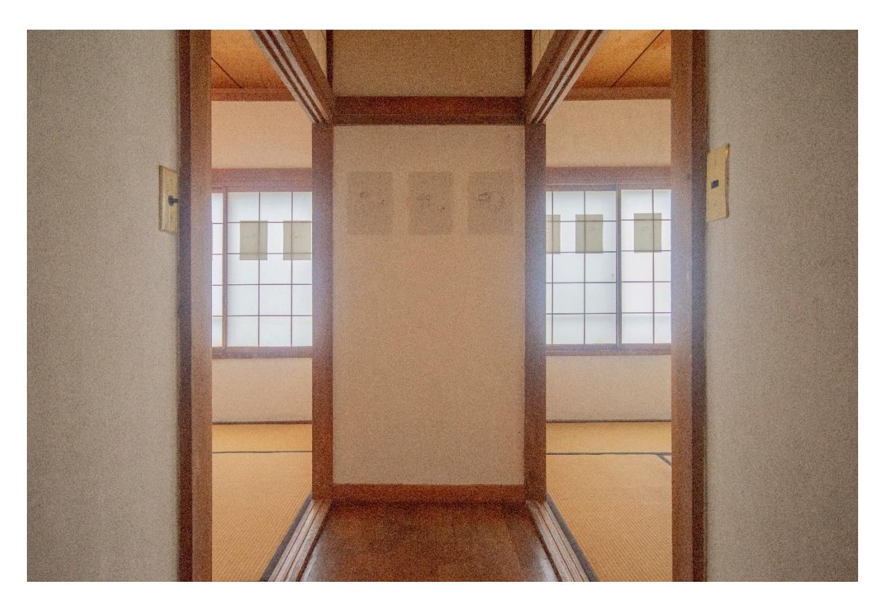
Towards A Consensual Hallucination, 2023 Installation view