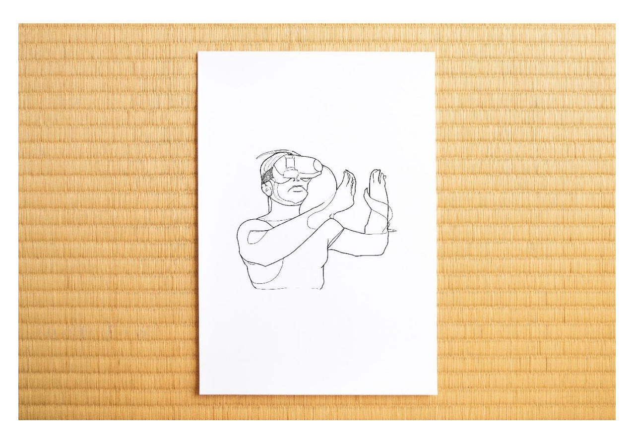
Towards A Consensual Hallucination XI, 2023 Black gel ink on 380gsm Hahnemuhle photo rag 29.7 x 21 cm