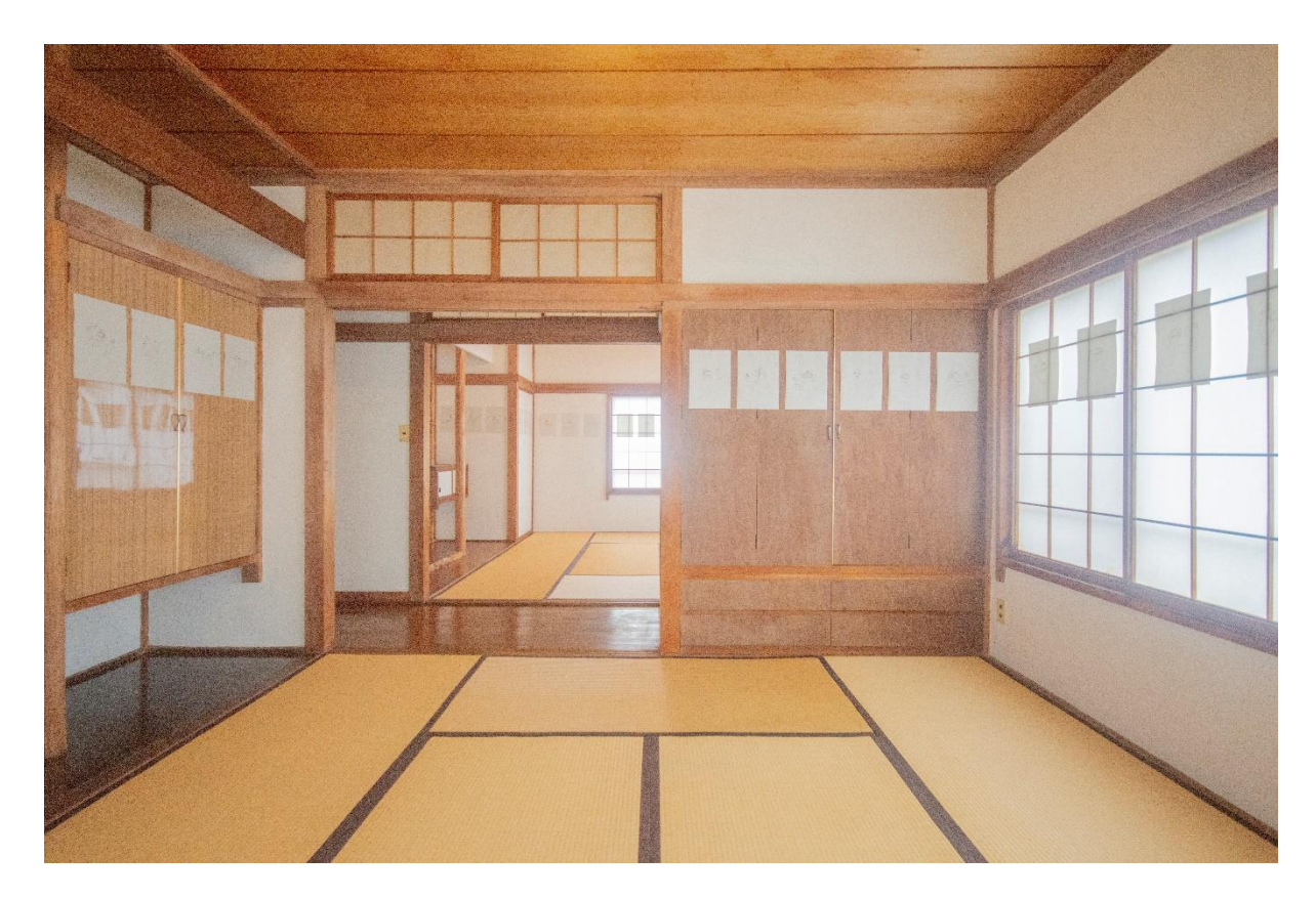
Towards A Consensual Hallucination, 2023 Installation view