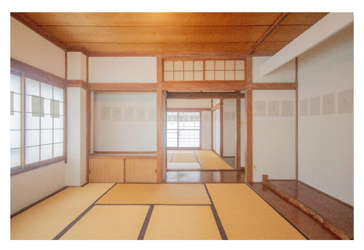
Towards A Consensual Hallucination, 2023 Installation view