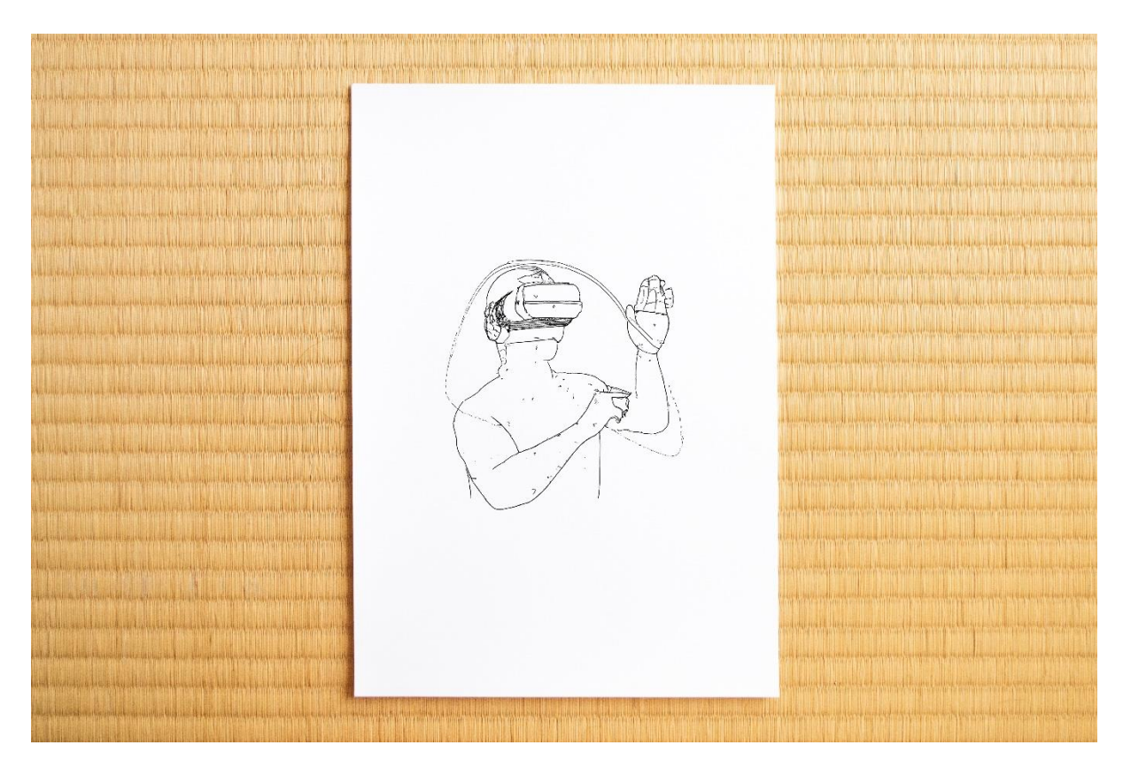
Towards A Consensual Hallucination X, 2023 Black gel ink on 380gsm Hahnemuhle photo rag 29.7 x 21 cm