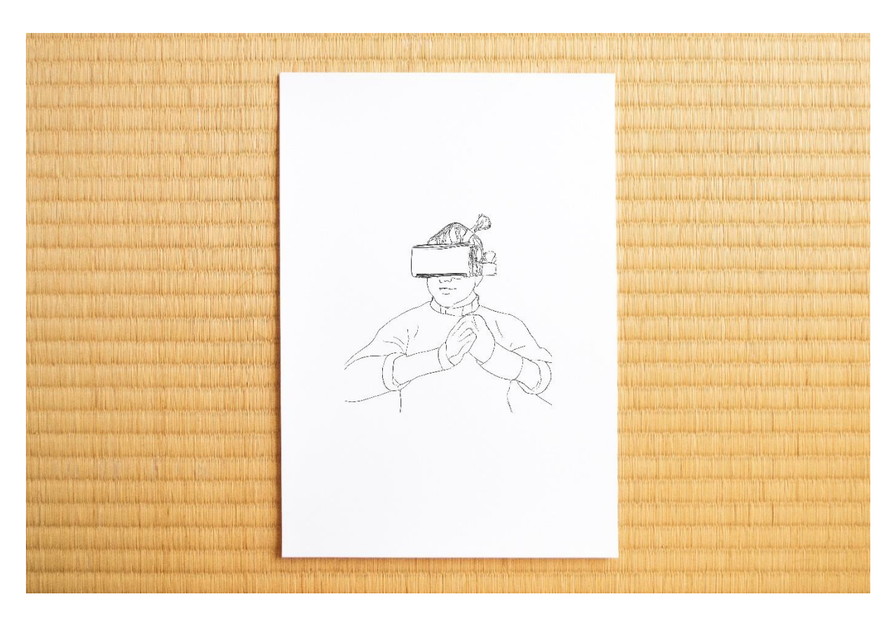
Towards A Consensual Hallucination III, 2023 Black gel ink on 380gsm Hahnemuhle photo rag 29.7 x 21 cm