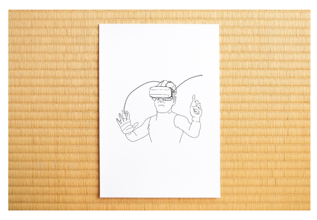
Towards A Consensual Hallucination IX, 2023 Black gel ink on 380gsm Hahnemuhle photo rag 29.7 x 21 cm