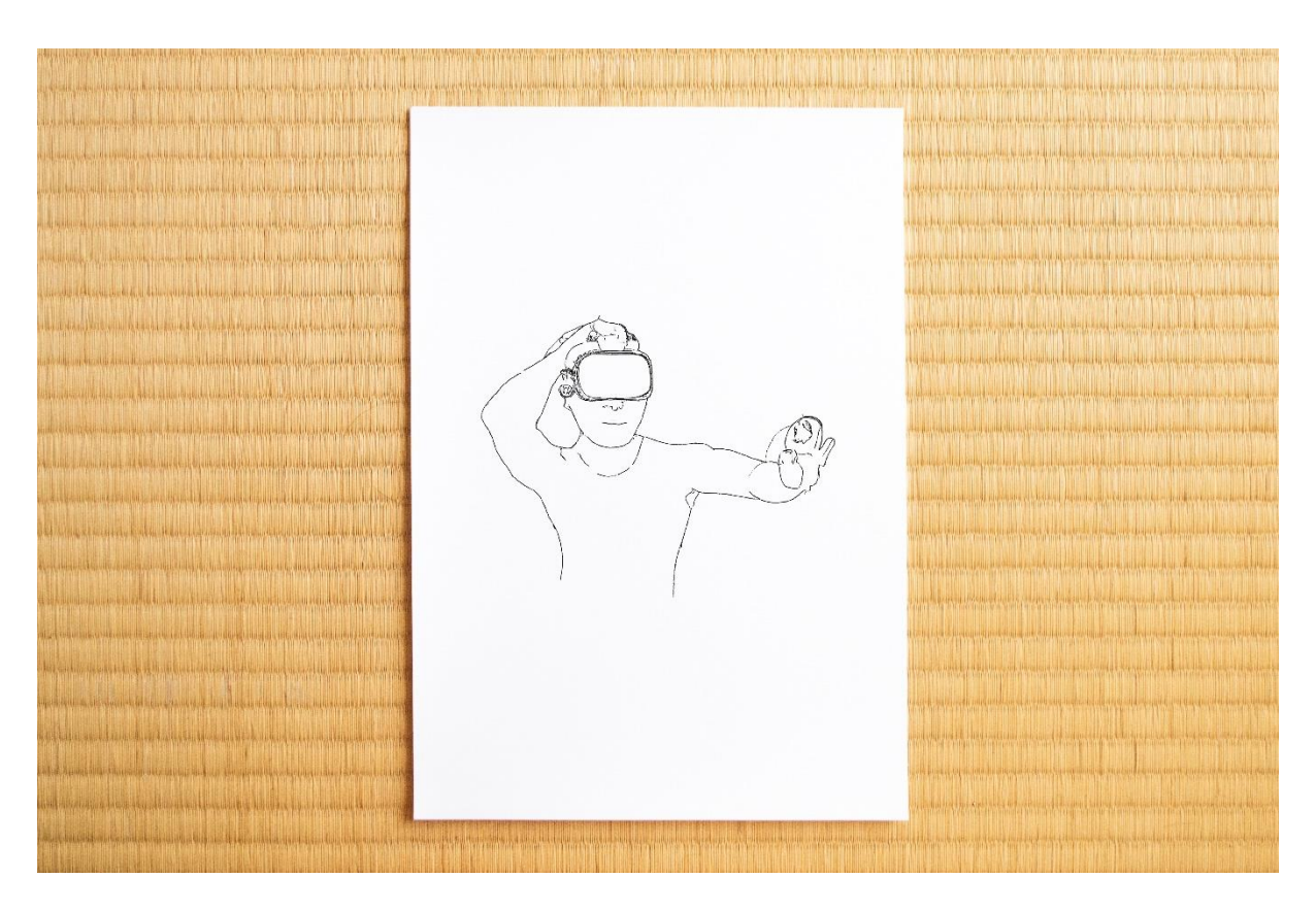
Towards A Consensual Hallucination VIII, 2023 Black gel ink on 380gsm Hahnemuhle photo rag 29.7 x 21 cm