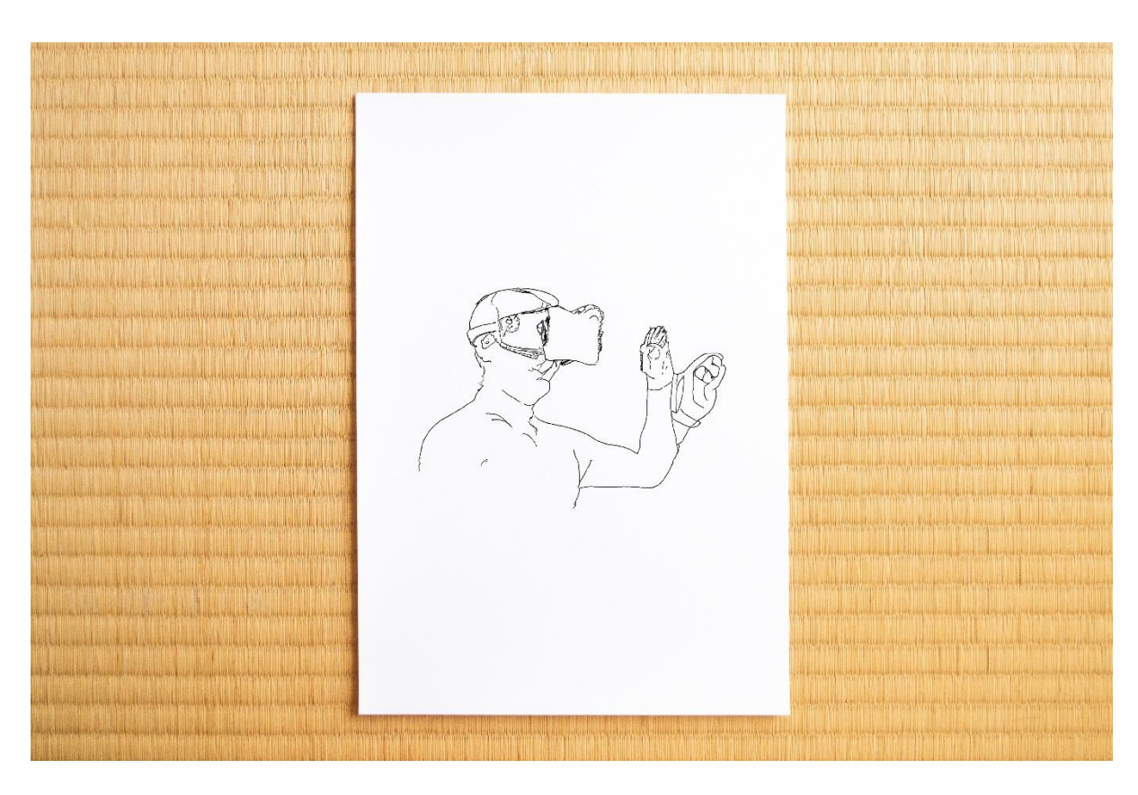
Towards A Consensual Hallucination XII, 2023 Black gel ink on 380gsm Hahnemuhle photo rag 29.7 x 21 cm