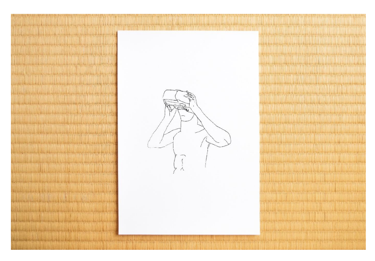
Towards A Consensual Hallucination V, 2023 Black gel ink on 380gsm Hahnemuhle photo rag 29.7 x 21 cm