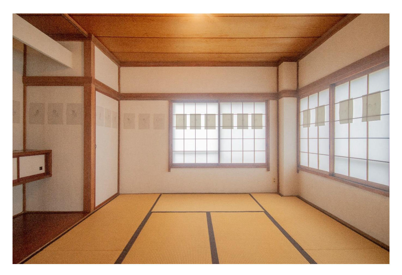
Towards A Consensual Hallucination, 2023 Installation view