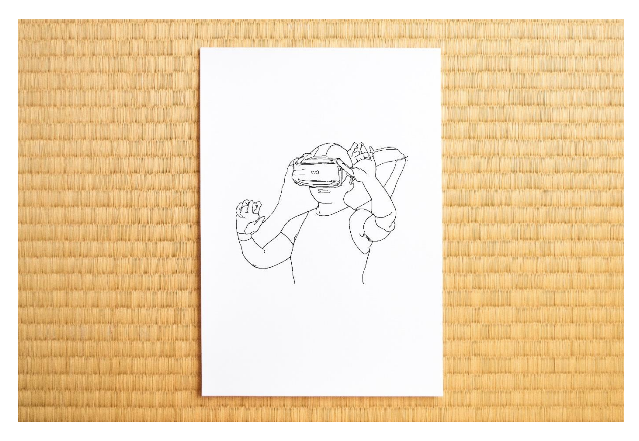
Towards A Consensual Hallucination I, 2023 Black gel ink on 380gsm Hahnemuhle photo rag 29.7 x 21 cm