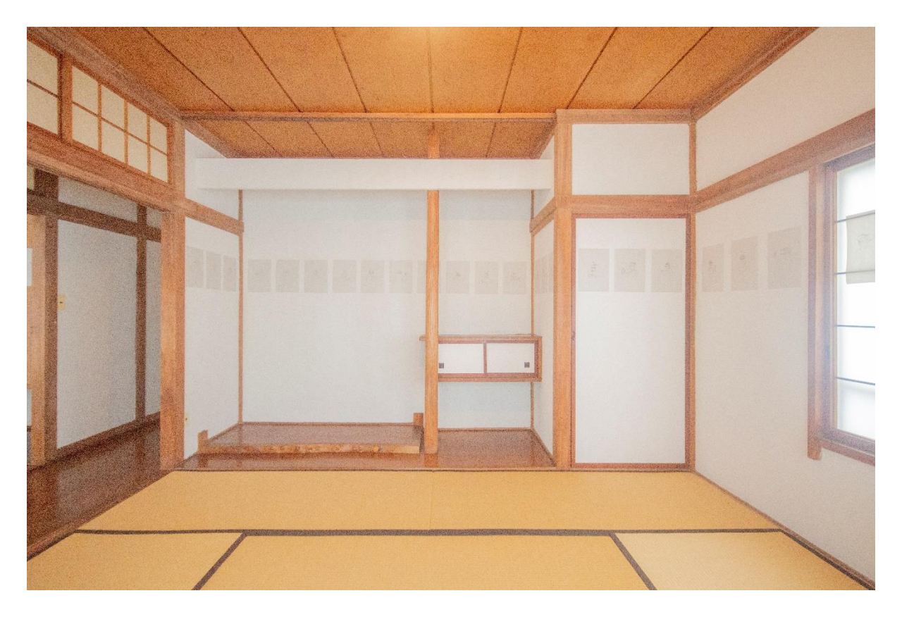
Towards A Consensual Hallucination, 2023 Installation view