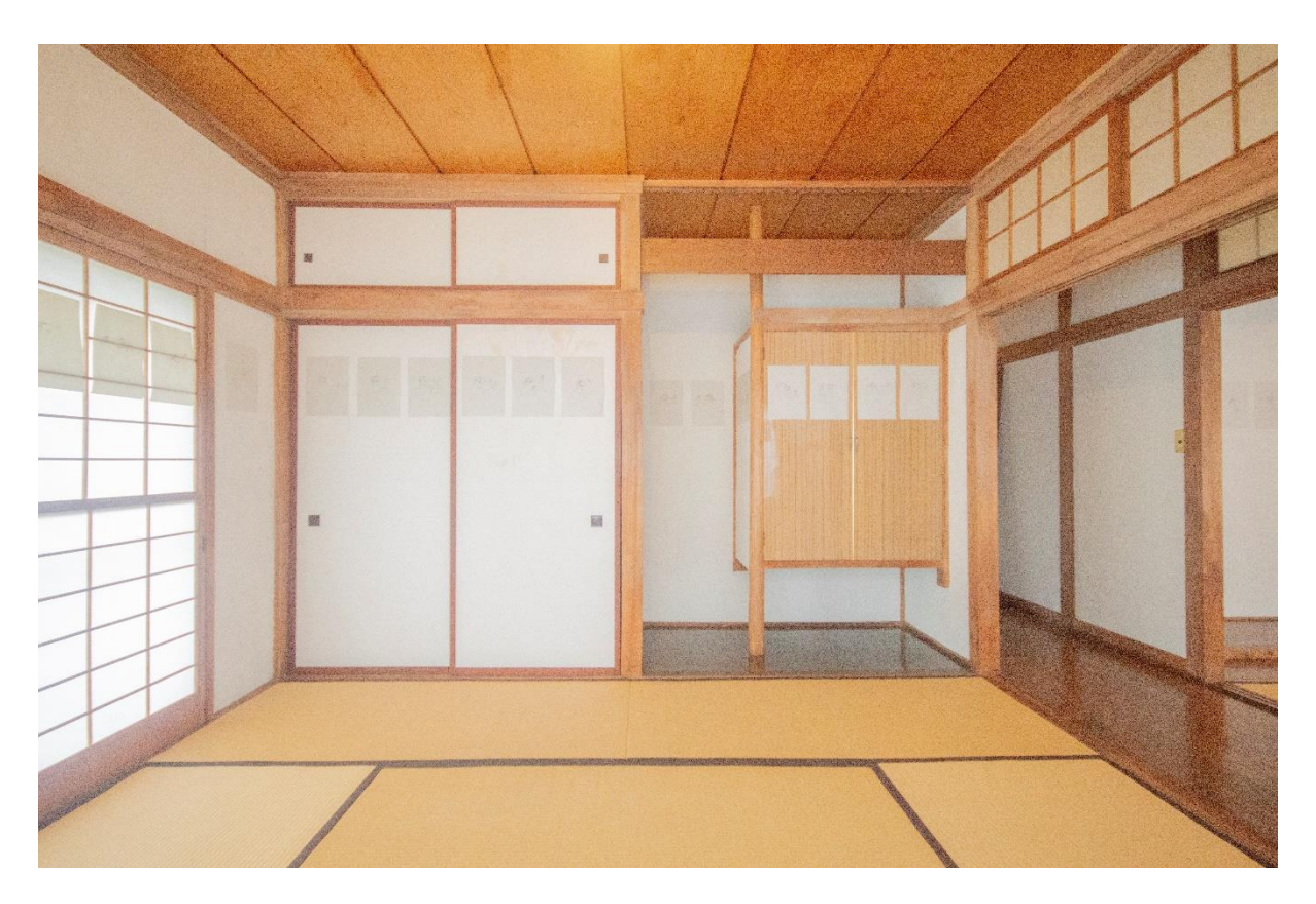
Towards A Consensual Hallucination, 2023 Installation view