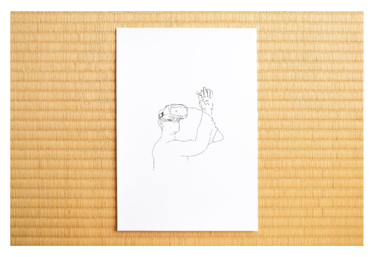
Towards A Consensual Hallucination IV, 2023 Black gel ink on 380gsm Hahnemuhle photo rag 29.7 x 21 cm