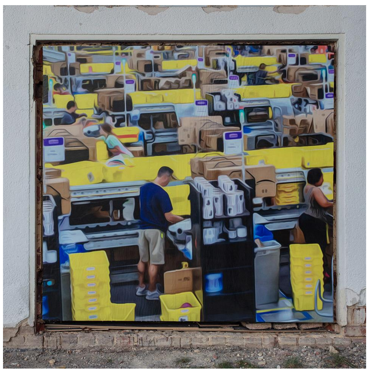
Quality Control, 2020. Ink and acrylic on canvas 100 x 100 cm Unique