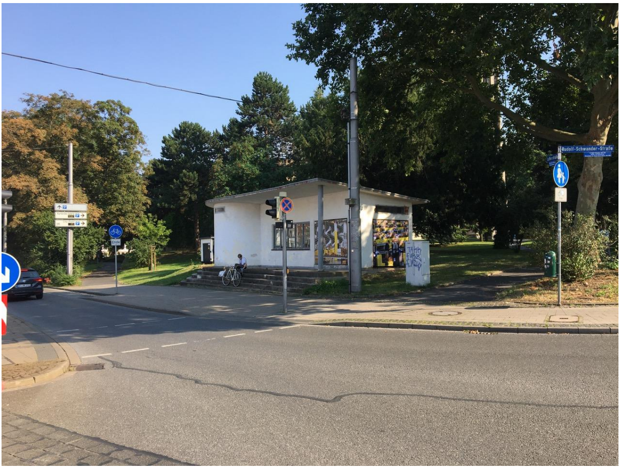
TRAFOHAUS Installation view

At TRAFOHAUS, two photographs of original works in the series were expanded and exhibited as an artist billboard.