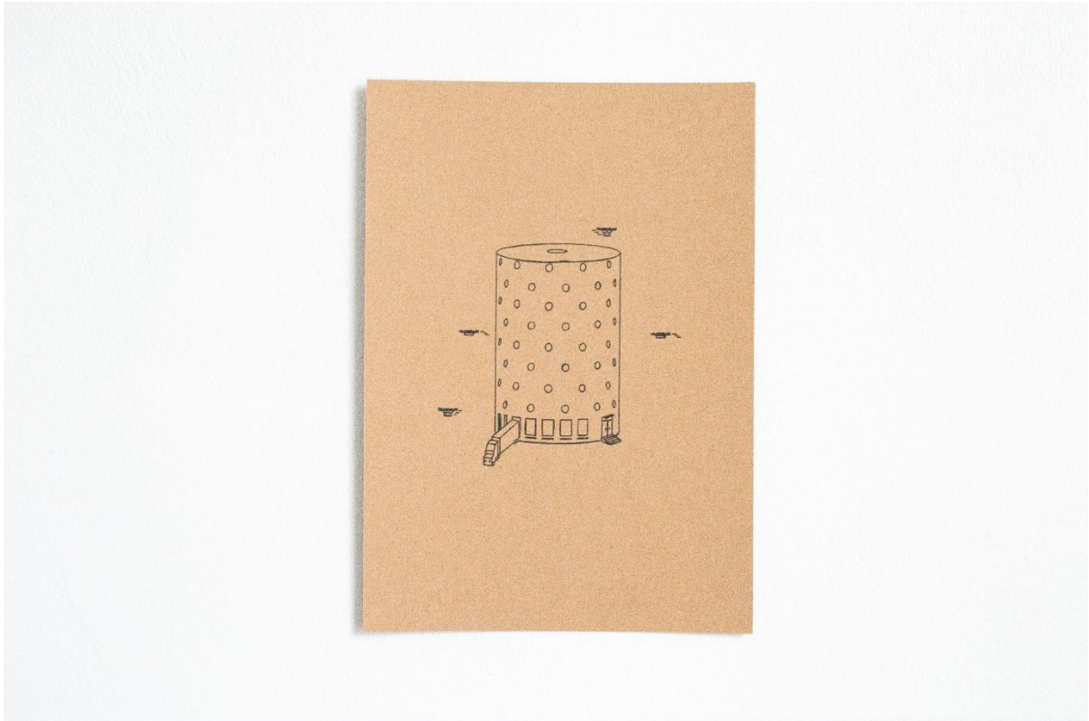
Drone Tower II, 2020 Black gel ink on 260gsm acid free kraft paper 21 x 14.8 cm Unique