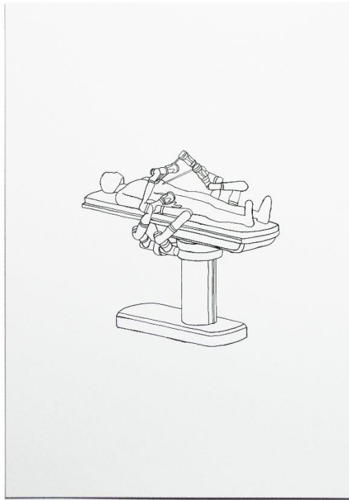
Forward Thinking, 2022 Black gel ink on 380gsm Hahnemuhle photo rag 42 x 29.7 cm Unique