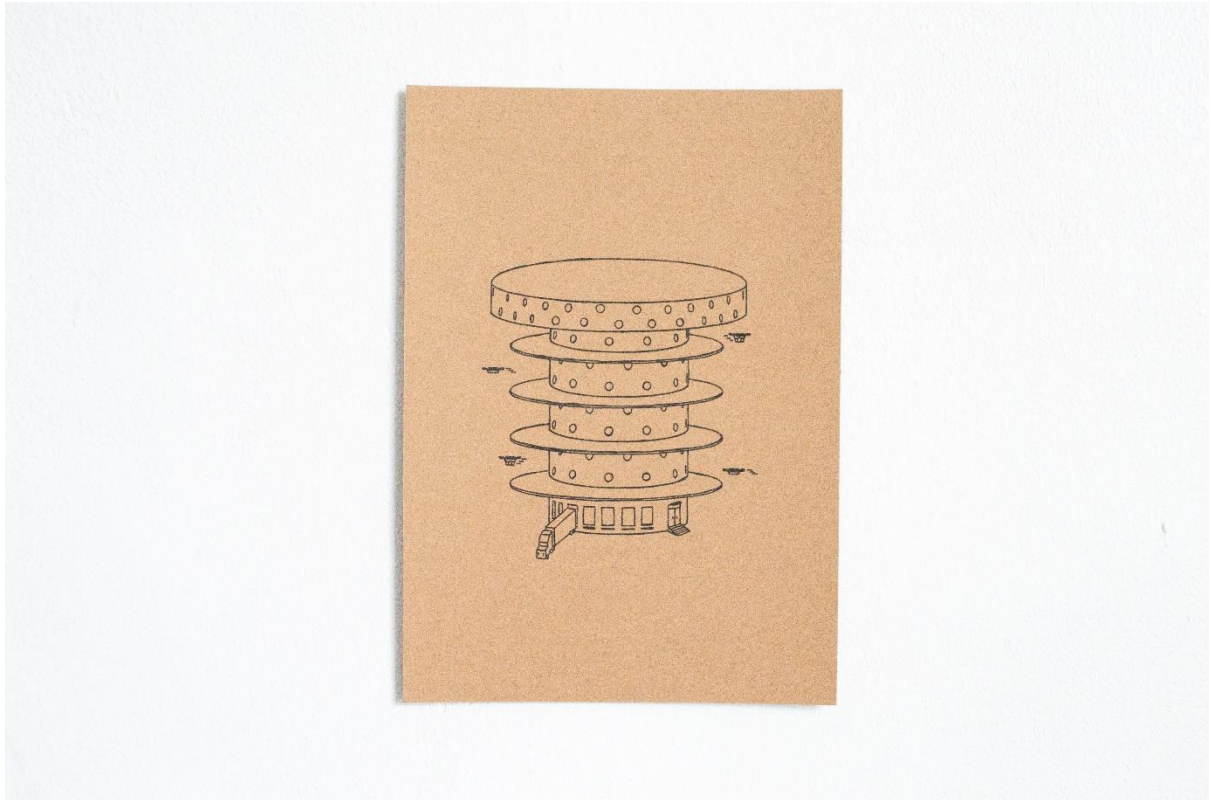
Drone Tower I, 2020 Black gel ink on 260gsm acid free kraft paper 21 x 14.8 cm Unique