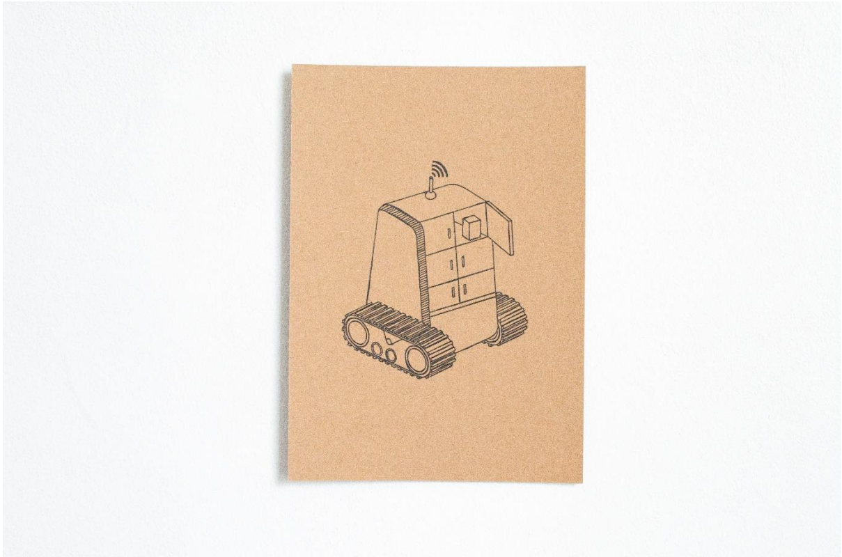
Storage Compartment Vehicle (Terrestrial), 2020 Black gel ink on 260gsm acid free kraft paper 21 x 14.8 cm Unique