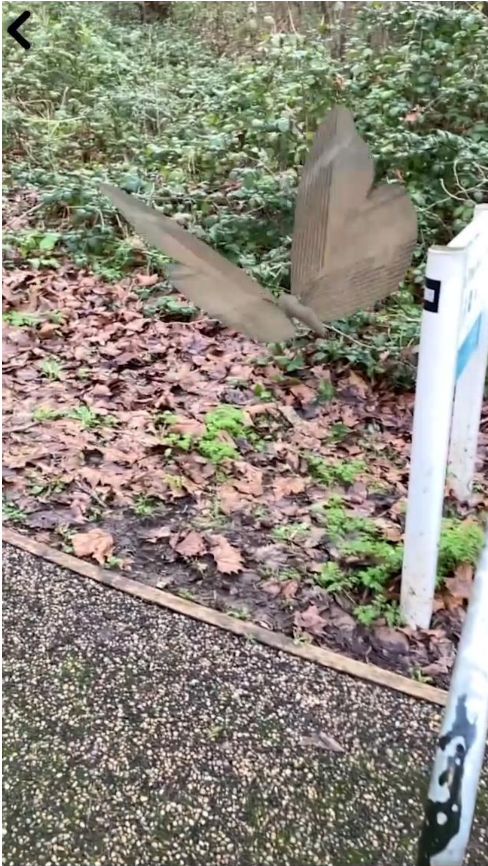
Nothing To Hide, 2022 Augmented reality, obj files and textures Dimensions variable