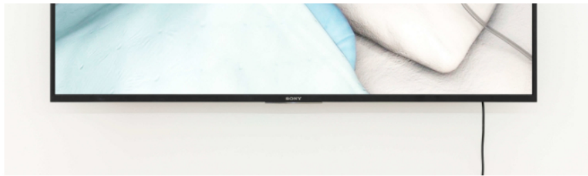
Bob Bicknell-Knight, Outbreak, 2020 (Installation view). HD video with sound, 1 min 25 sec (looped).