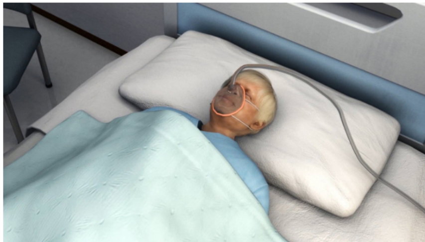
Bob Bicknell-Knight, Outbreak, 2020. HD video with sound, 1 min 25 sec (looped).

Out of frustration with the British government, Bob Bicknell-Knight made a picture of Boris Johnson - sick with COVID, the prime minister lies in bed and is ventilated. Bicknell-Knight tells us how he is experiencing the pandemic and why he wants to move to the country in 2021.