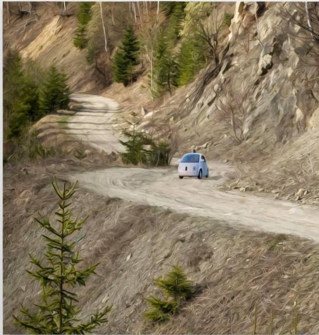
A Drive in the Valley, 2018 Acrylic, ink, varnish and PVA on canvas 60 x 60 cm Unique