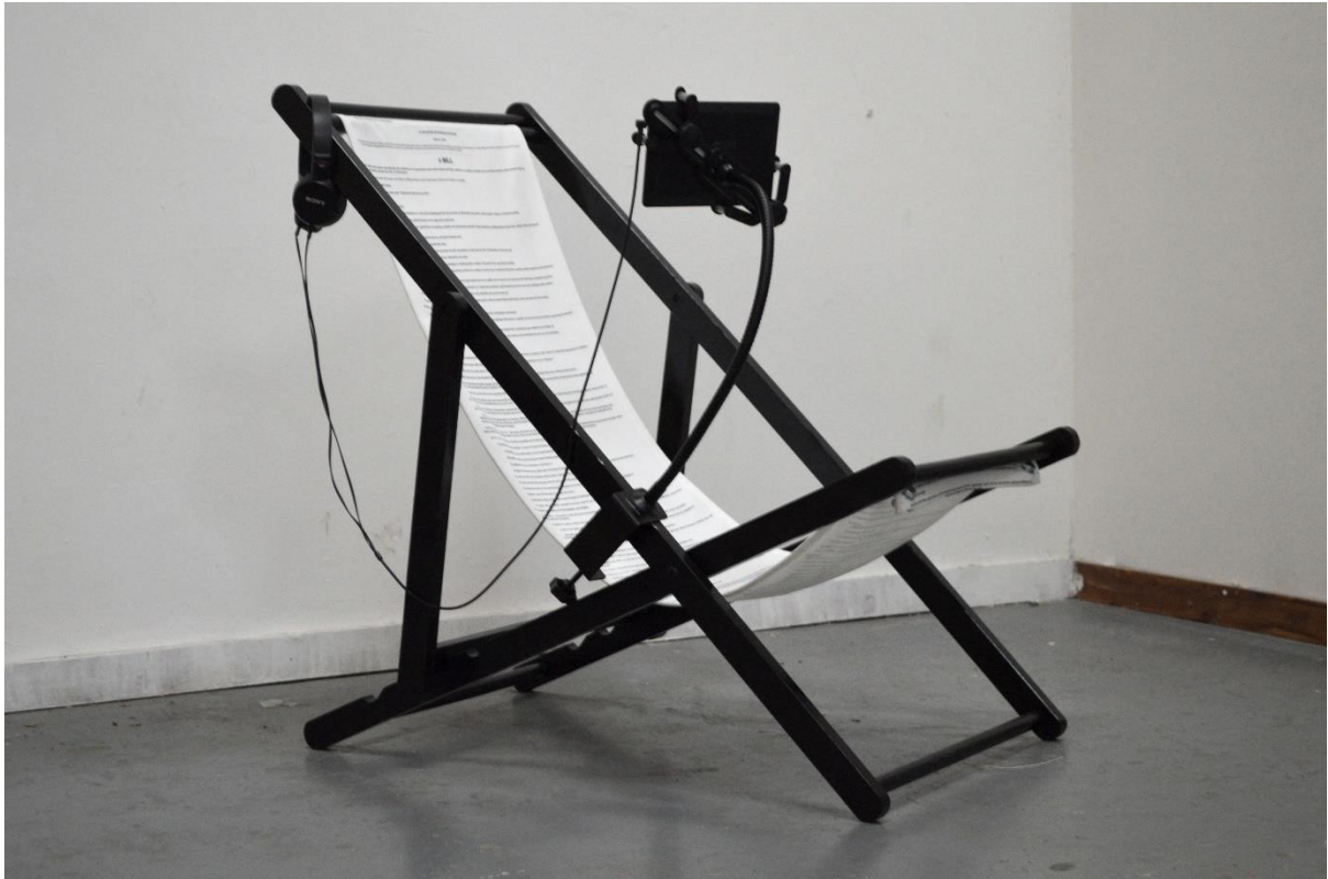
Colleen and Joshua, 2016 Deck chair, kindle fire, tablet mount, printed canvas, headphones Dimensions variable