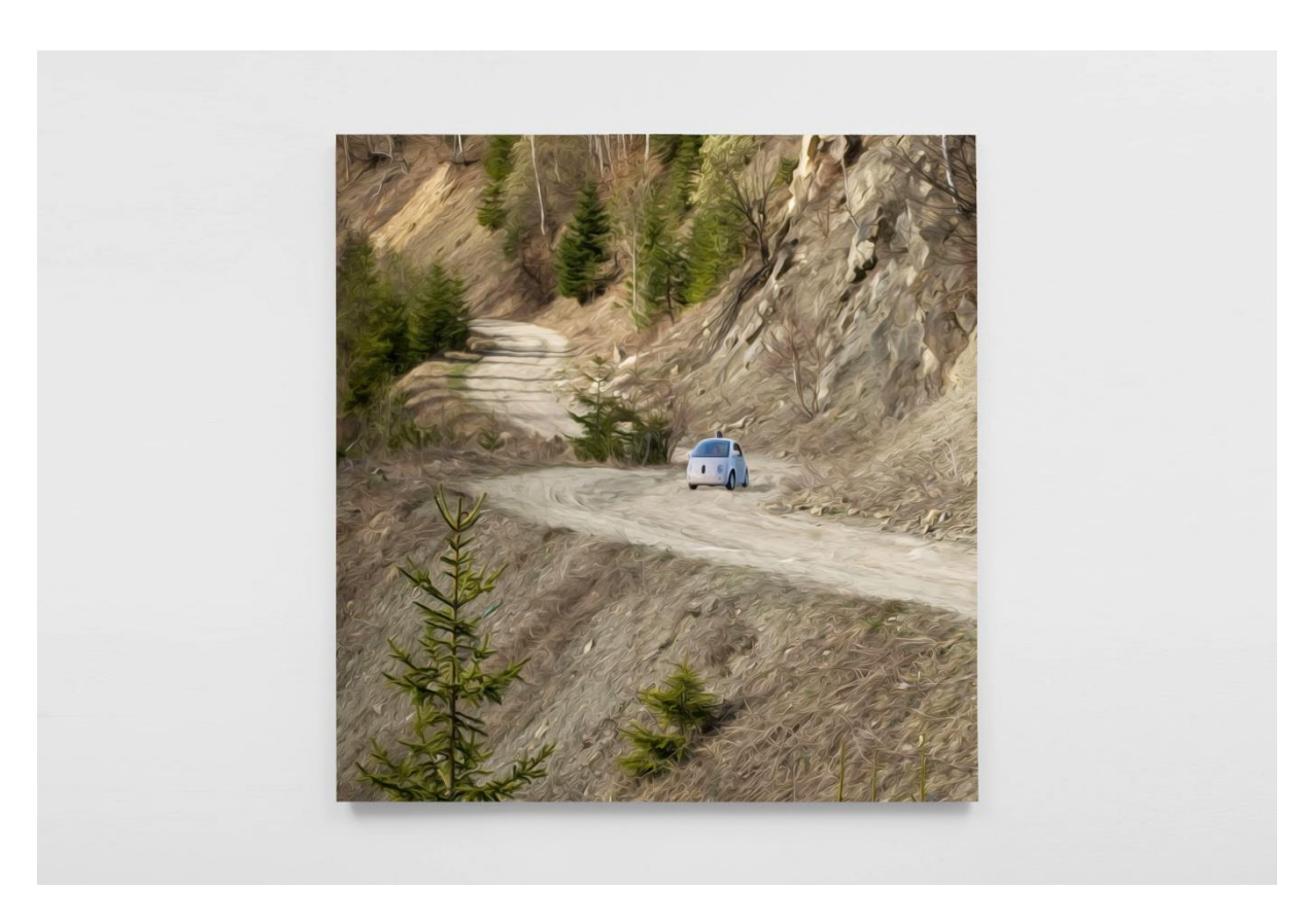
A Drive in the Valley, 2018 Acrylic, ink, varnish and PVA on canvas 60 x 60 cm Unique